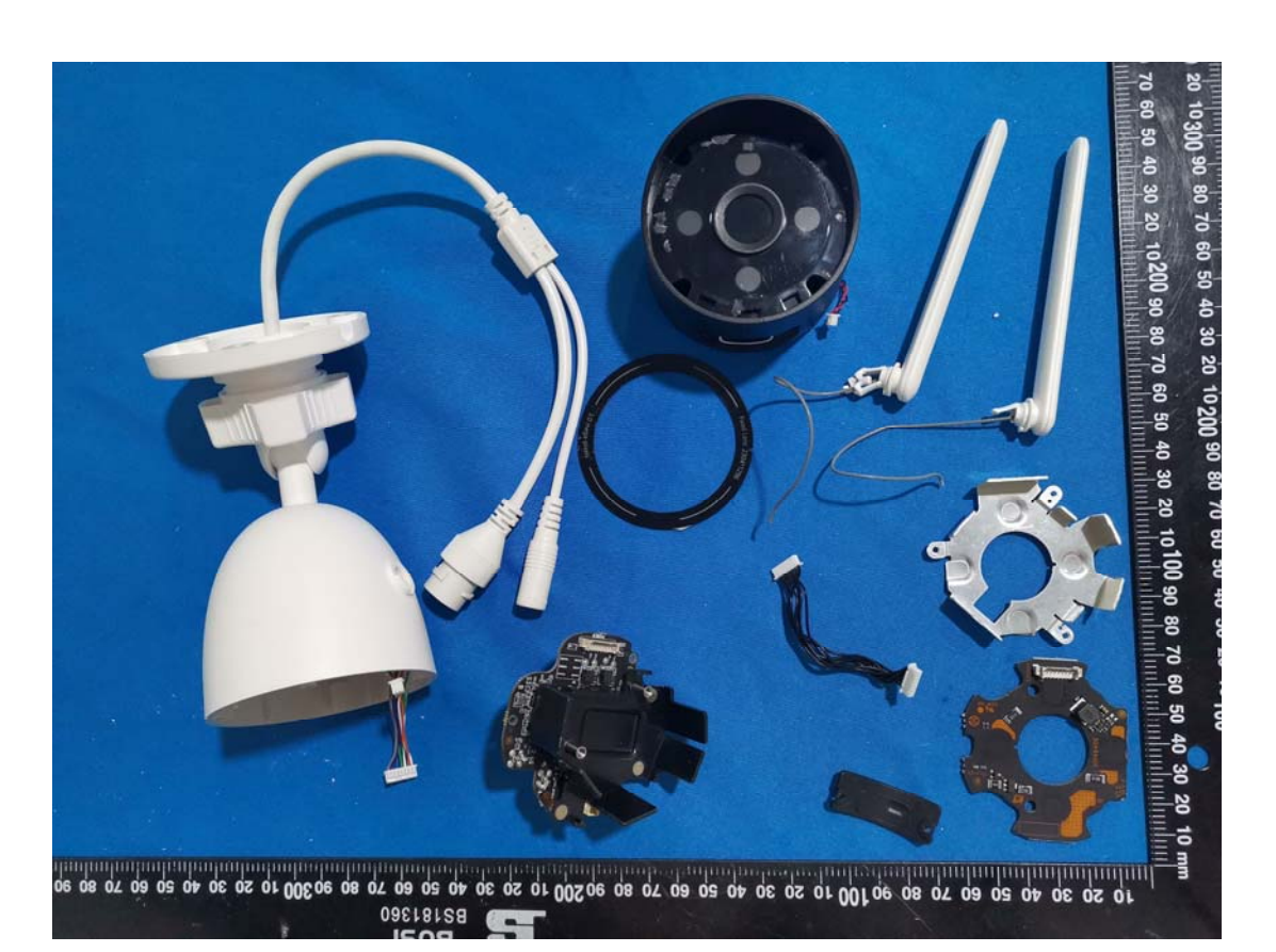
EXHIBIT C - EUT INTERNAL PHOTOGRAPHS