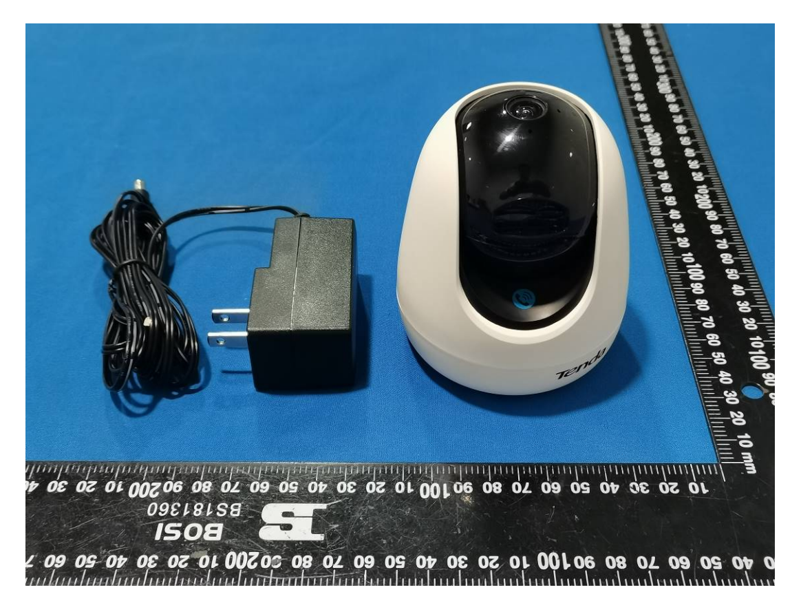
EXHIBIT B - EUT EXTERNAL PHOTOGRAPHS