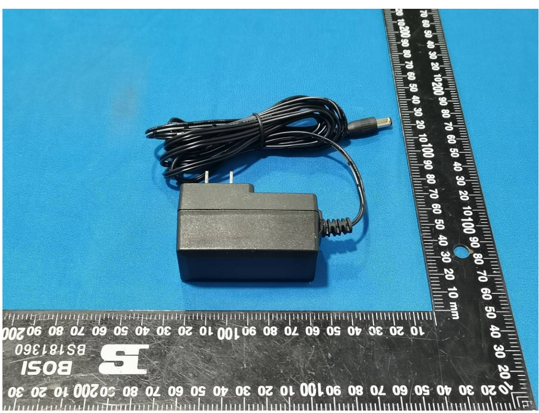
Page 3 of 4