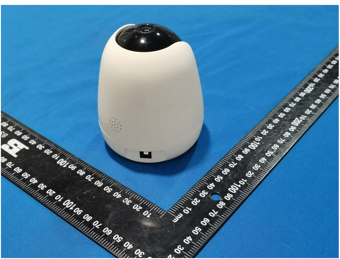
Page 1 of 4