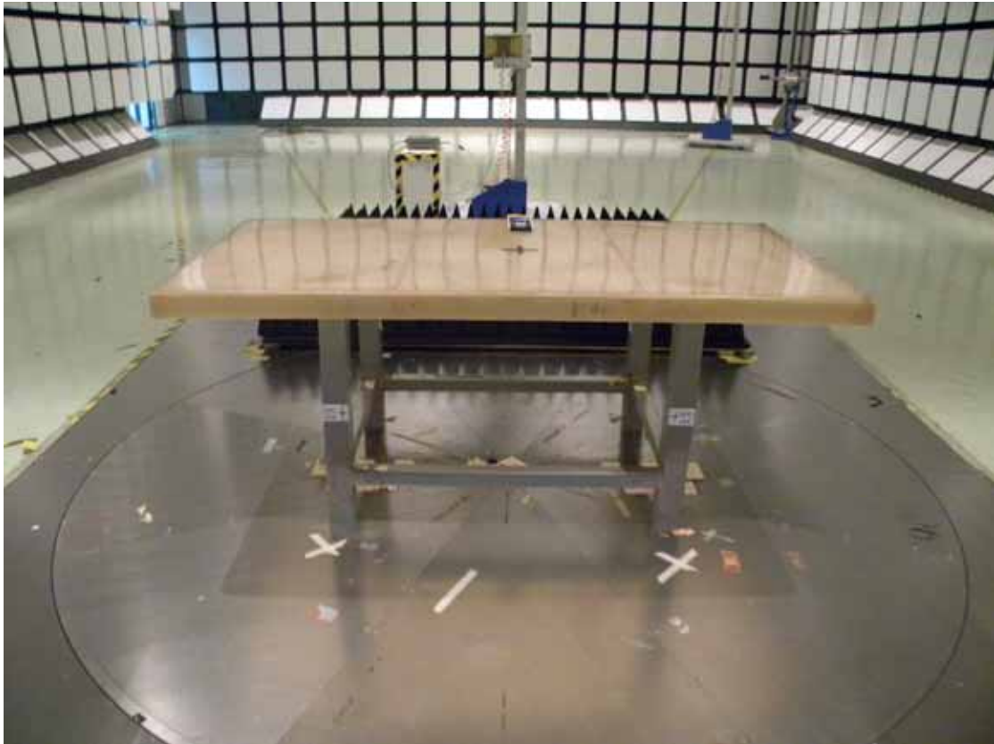
Front View (For Configuration 1,3)