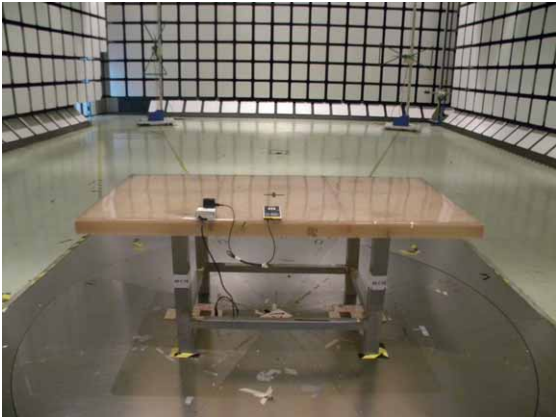
Back View of Radiated Measurement (For Configuration 2,4)