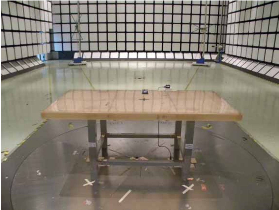
Front View of Radiated Measurement (For Configuration 2,4)