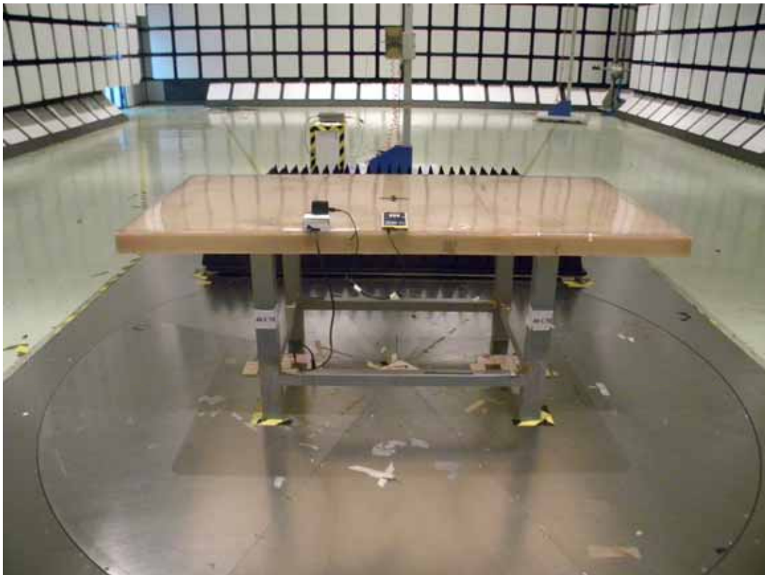
Back View (For Configuration 2,4)