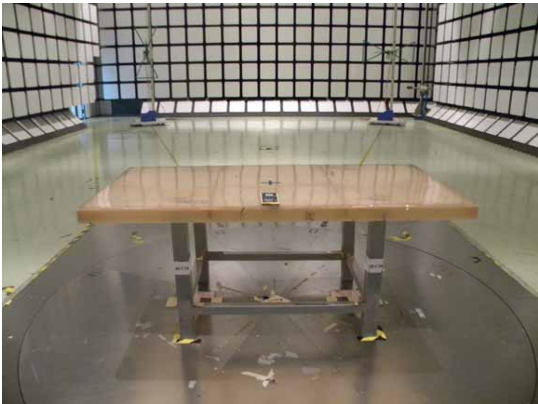
Back View of Radiated Measurement (For Configuration 1,3)