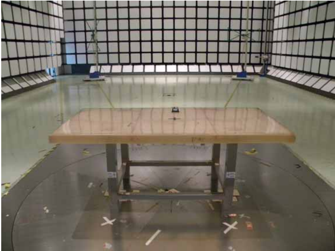
Front View of Radiated Measurement (For Configuration 1,3)