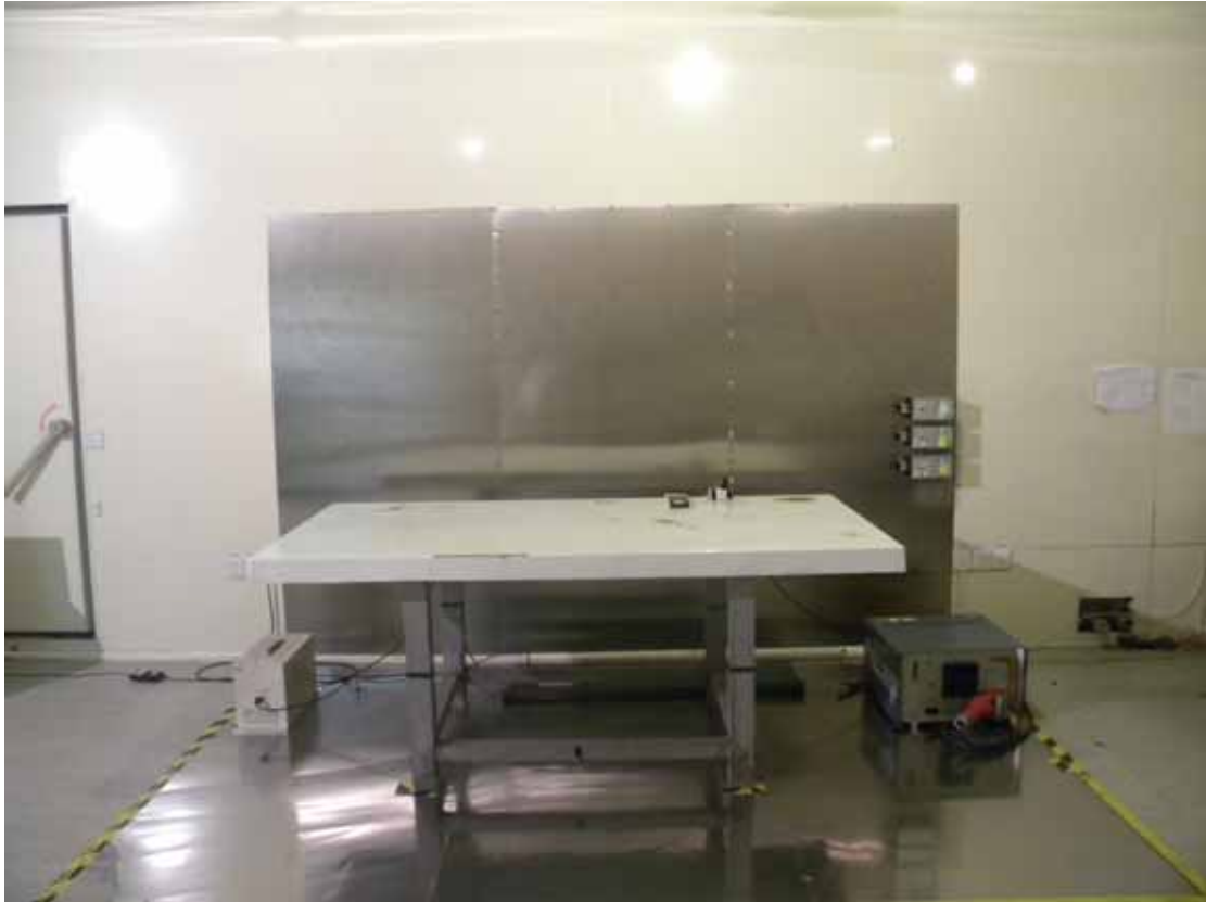
Front View of conducted emission measurement