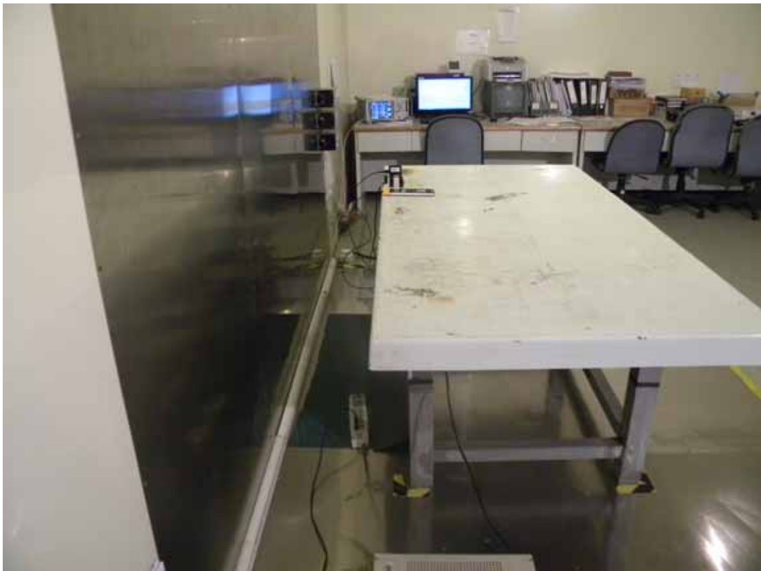
Side View of conducted emission measurement