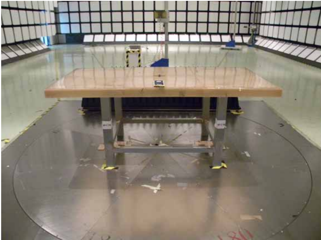
Back View (For Configuration 1,3)