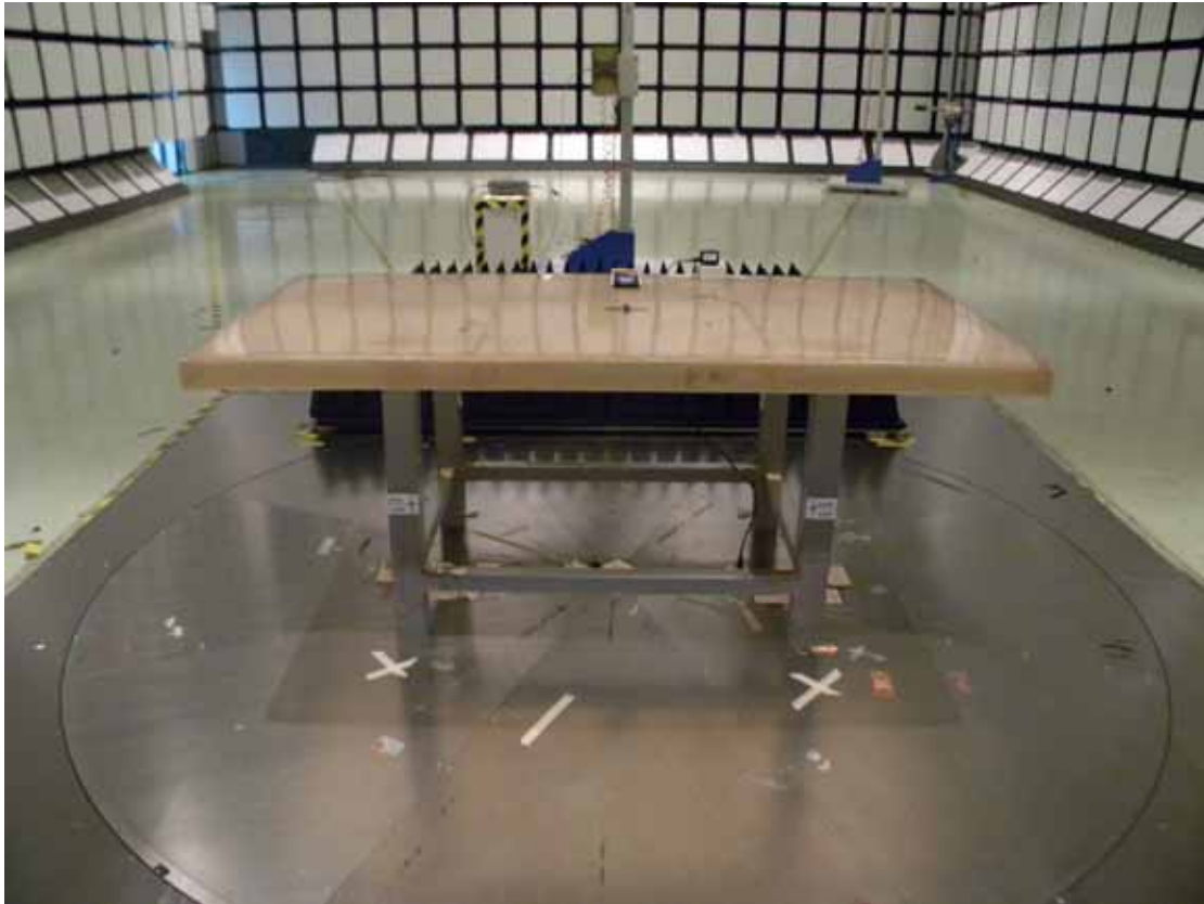
Front View (For Configuration 2,4)