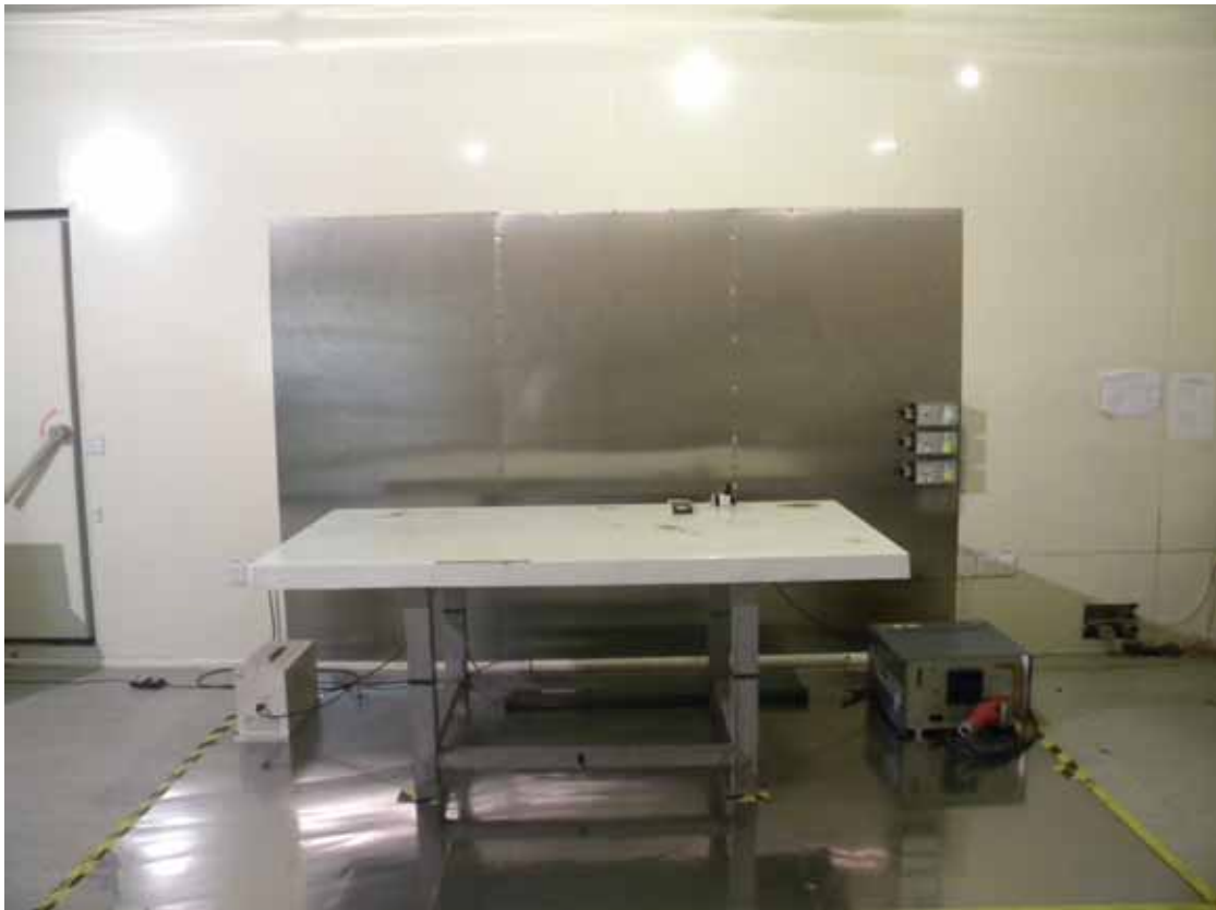
Front View of conducted emission measurement