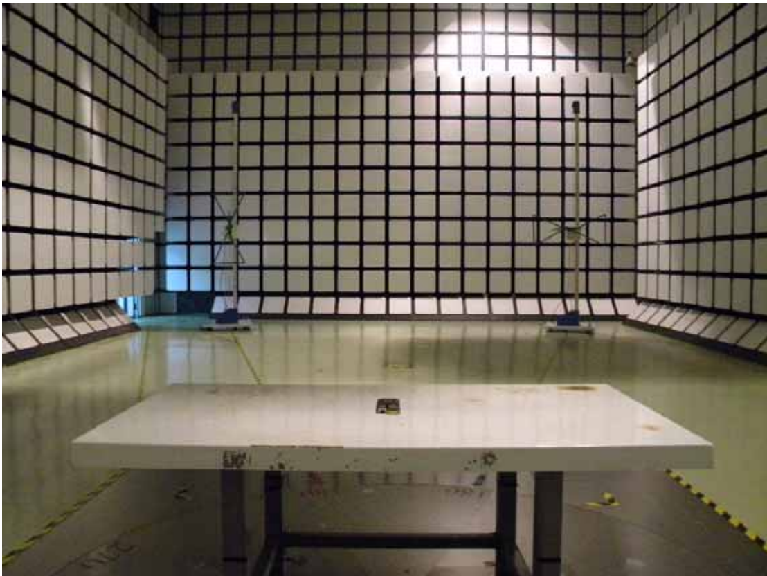
Back View of Radiated Measurement