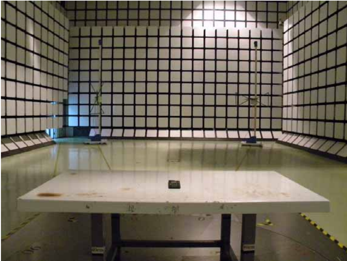
Front View of Radiated Measurement