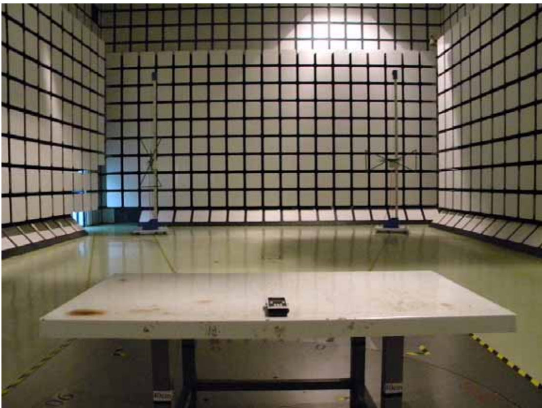
Back View of Radiated Measurement (Configuration A)