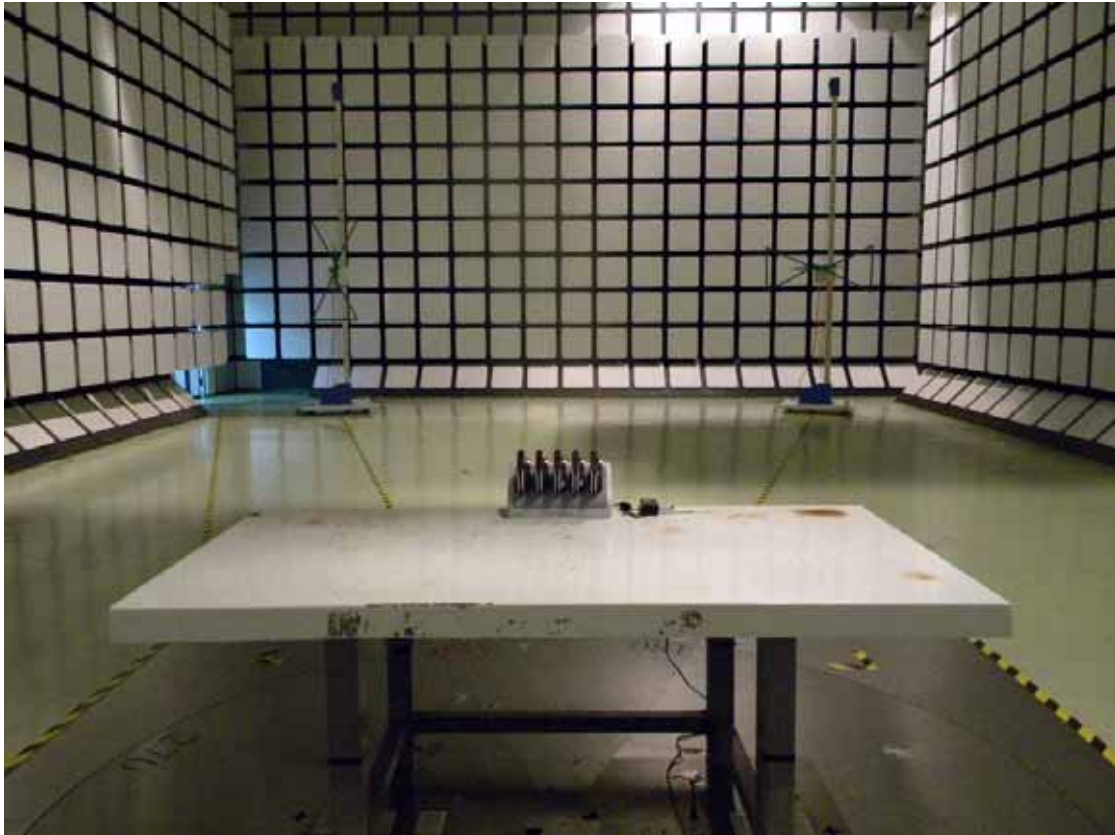
Front View of Radiated Measurement (Configuration B)