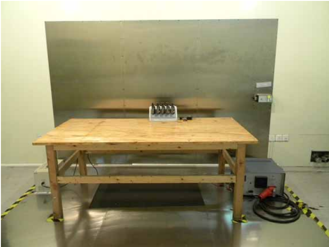
Front View of Conducted Measurement