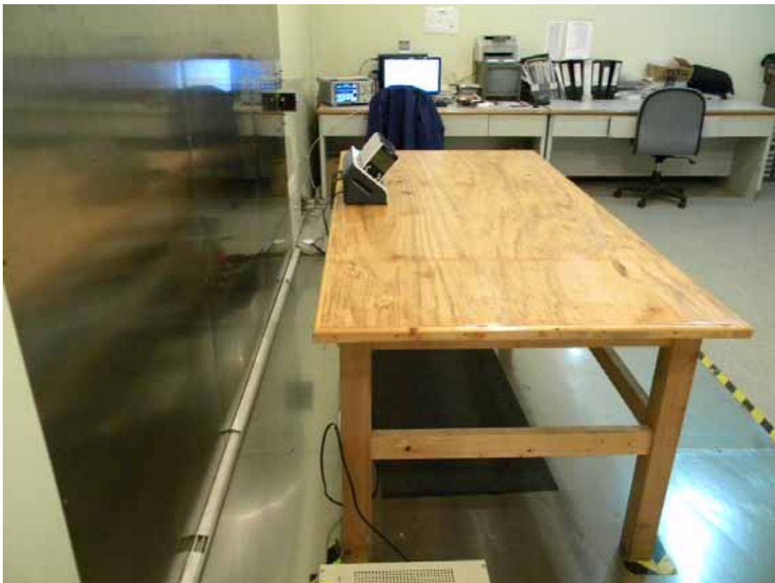
Side View of Conducted Measurement