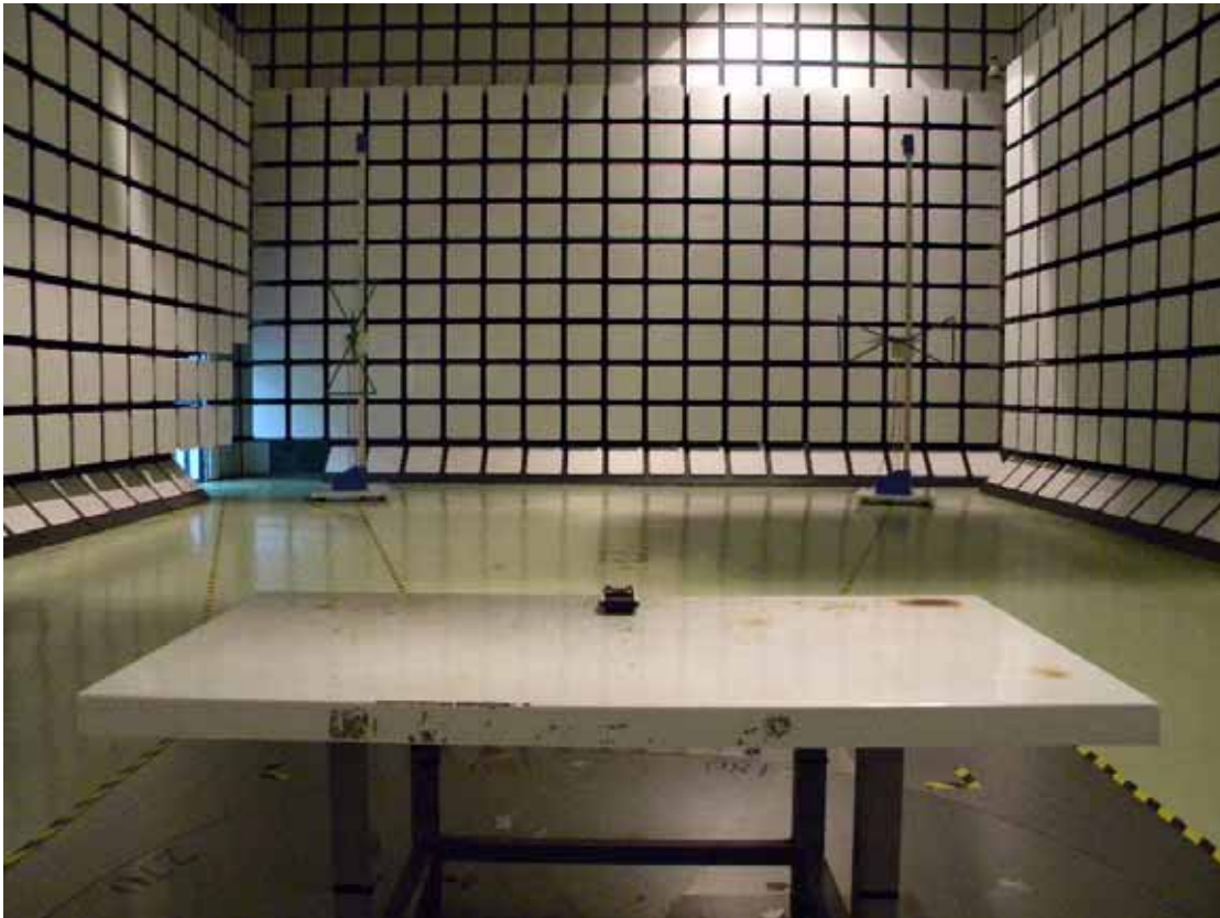
Front View of Radiated Measurement (Configuration A)