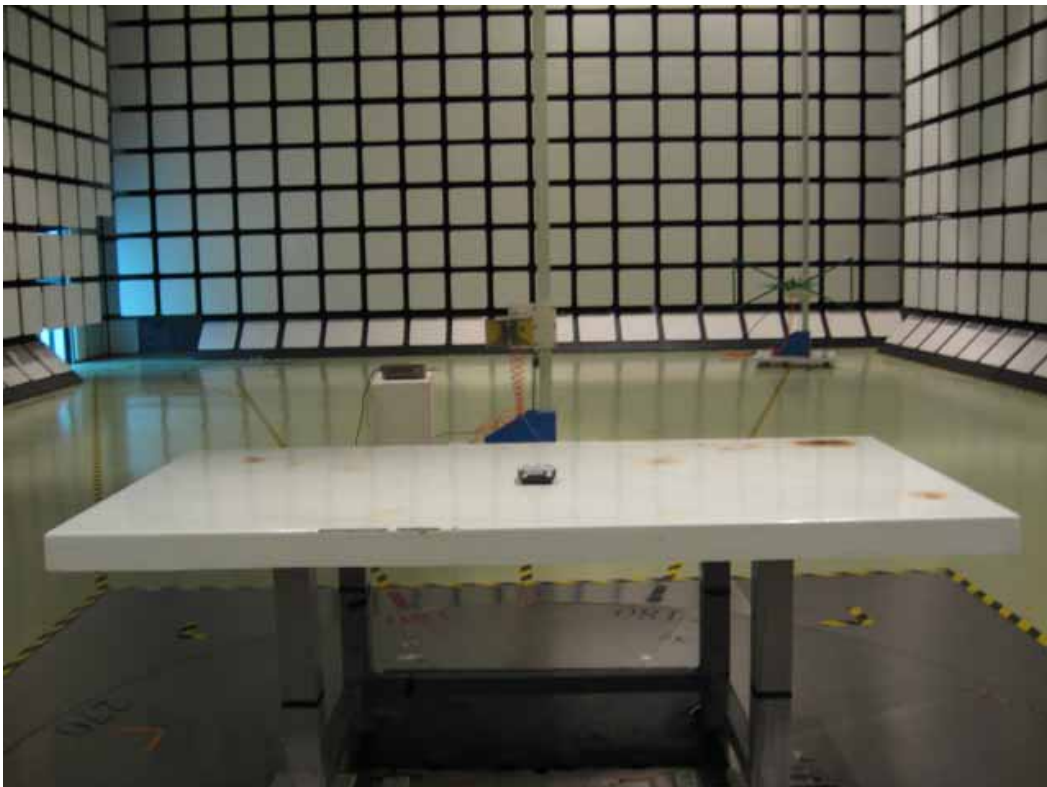
Back View of Radiated Disturbance Measurement