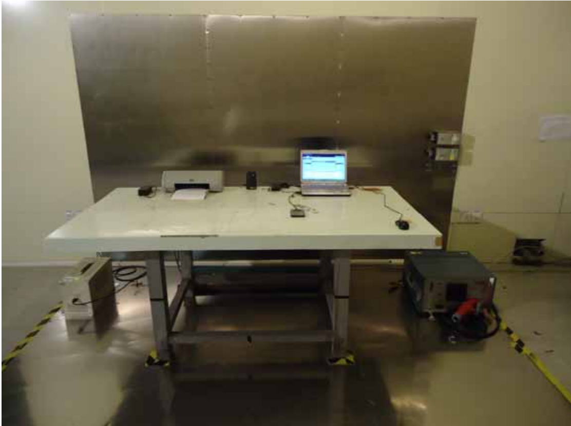
Front View of conducted emission measurement