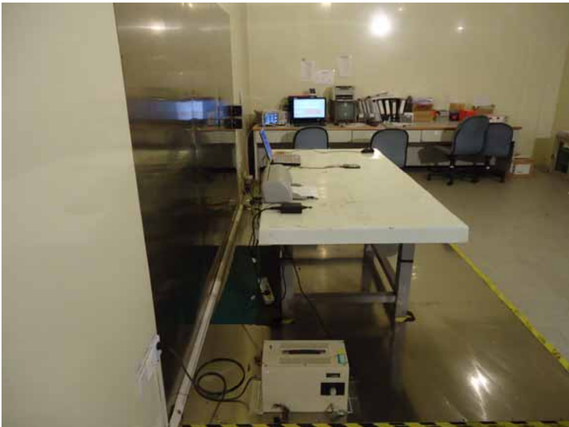
Side View of conducted emission measurement