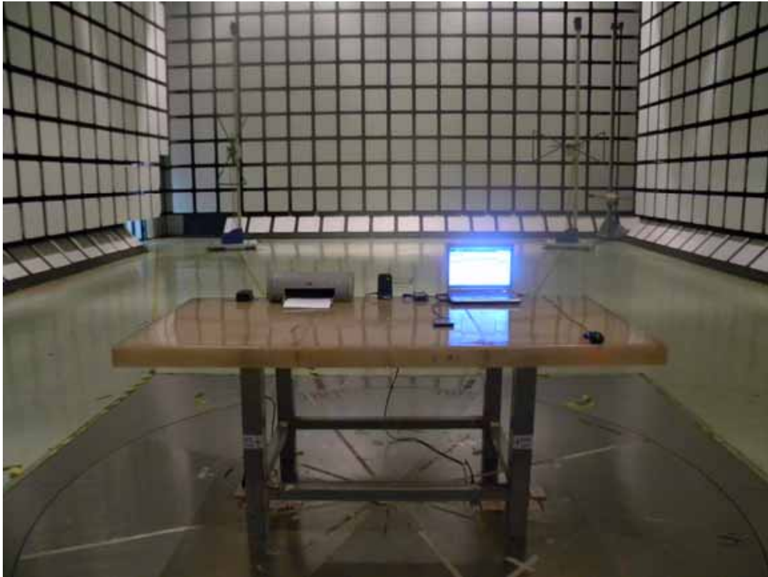
Front View of Radiated Measurement