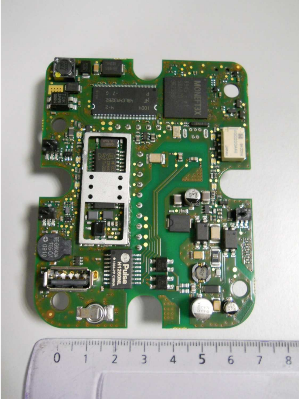
IntPho-1 : Front side of electronic board without shield cover