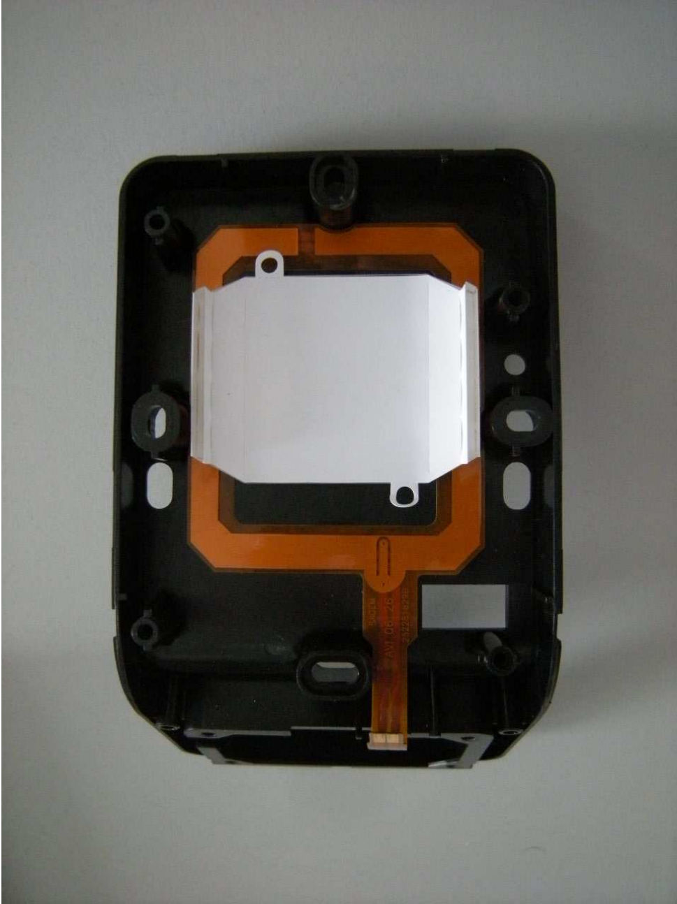
IntPho-4 : Inside view of front case with antenna and light-guide.