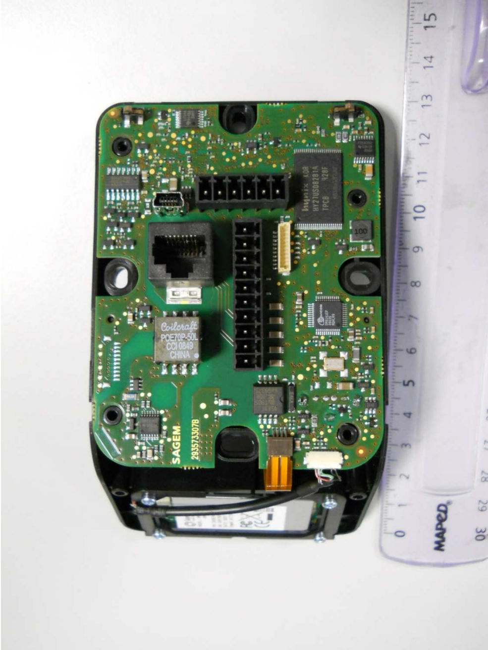
IntPho-5 : Inside view of product with electronic board positioned on front case and with CBM module (fingerprint recognition module) at the bottom