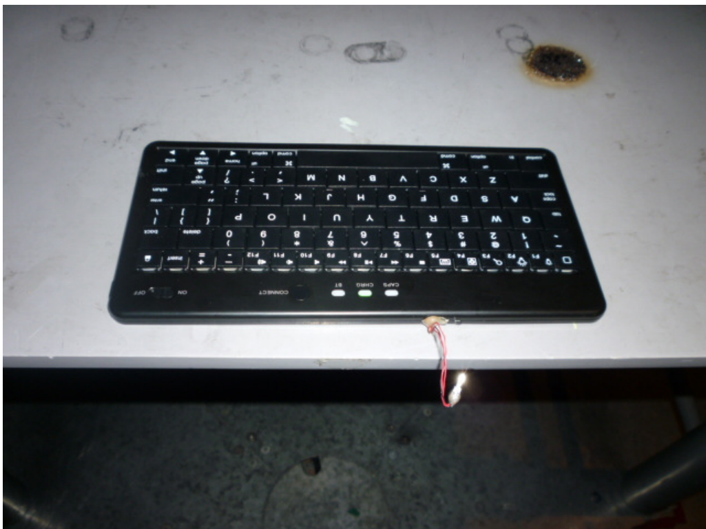
Set-up for Radiation Emission (Transceiver)