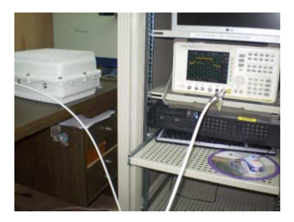
Photograph No.1 Peak output power, occupied bandwidth and spurious emissions at RF antenna connector test setups