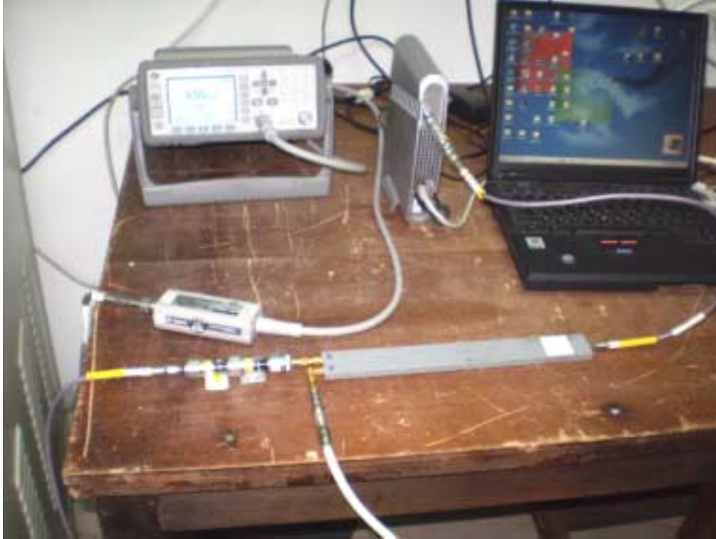
Photograph No.1 Peak output power and spurious emissions at RF antenna connector test setups