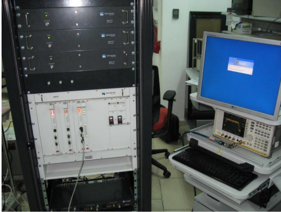
Photograph No.1 Peak output power, occupied bandwidth and spurious emissions at RF antenna connector test setup