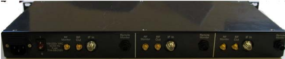
Figure 1: Upconverter rear panel

The Upconverter box includes three Plug-in Upconverter modules. Each of them is getting the DC input (8.5V) from a common power supply on the Upconverter box. The following are the Upconverter module pictures: