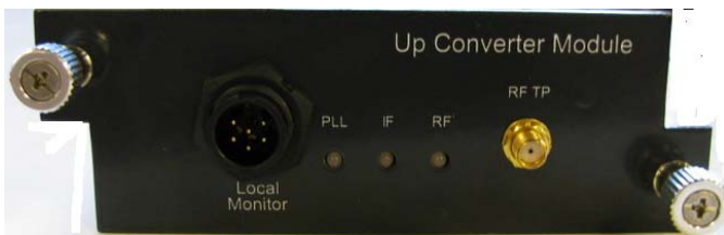
Figure 6: Upconverter module front panel