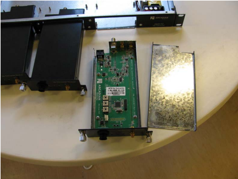
Figure 3: Upconverter module (remove cover)