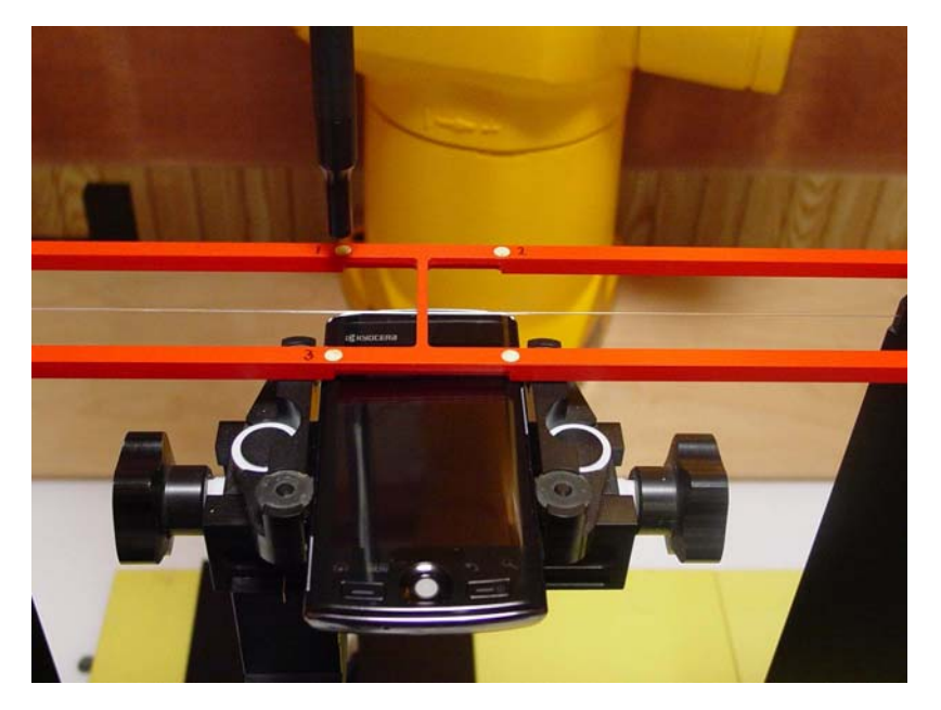
Figure 1a - HAC RF Emission Test Setup