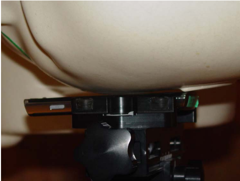
Figure 9E.1 Phone against the head (Left cheek position)