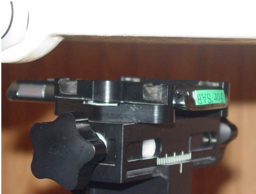
Figure 9E.3 Body SAR setup (Face Down, 22mm Air Separation)