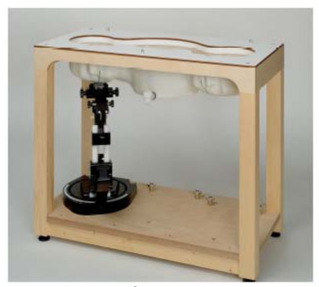
Figure 5.4 SAM Twin Phantom

The thickness of phantom shell is 2mm except for the ear, where an integrated ear spacer provides 6mm spacing from the tissue boundary. Manufacturer reports tolerance in shell thickness to be \pm 0.1mm.