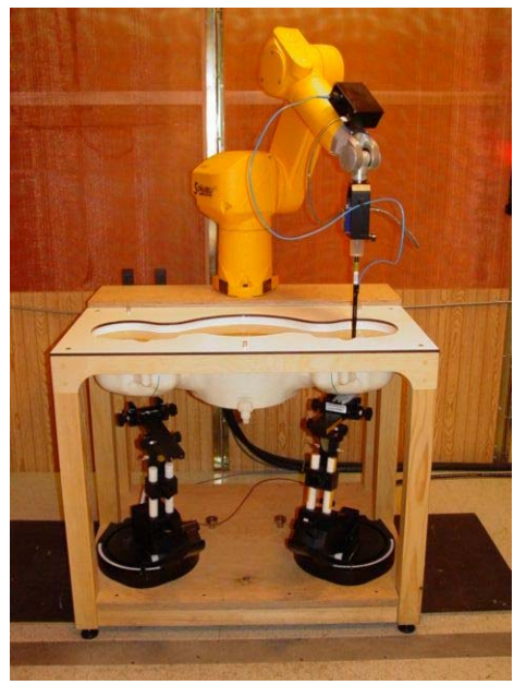
Figure 5.1 DASY 4 System

The calibration records of E-field probe and dipoles are attached in Appendix C and Appendix D respectively. Dipoles return-loss and input impedances are measured annually. (50824 DO2 Dipole SAR Validation Verification v01).