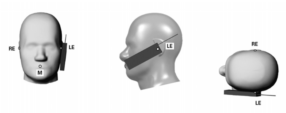
Figure 7.3 - Phone position 1, "cheek" or "touch" position.

"Initial ear position" alignments are maintained and the device is brought toward the mouth of the head phantom by pivoting along the "Neck-Front" line until any point on the display, keypad or mouthpiece portions of the handset is in contact with the phantom or when any portion of a foldout, sliding or similar keypad cover opened to its intended self-adjusting normal use position is in contact with the cheek or mouth of the phantom.