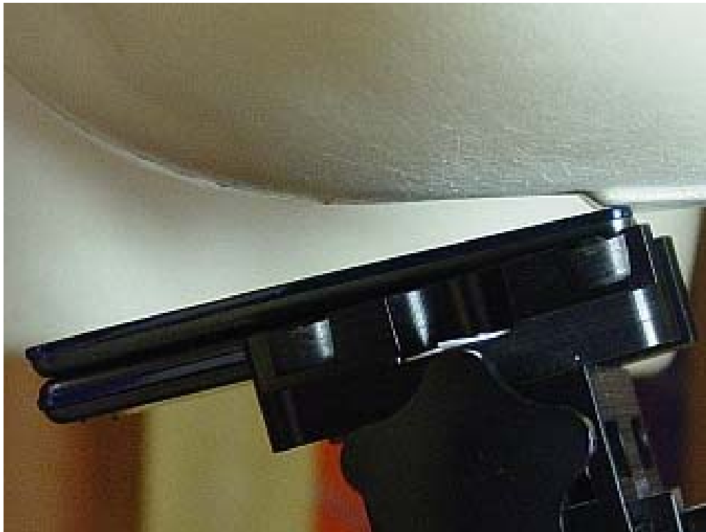
Figure 9E.2 Phone (Closed) against the head (Left Tilt position)