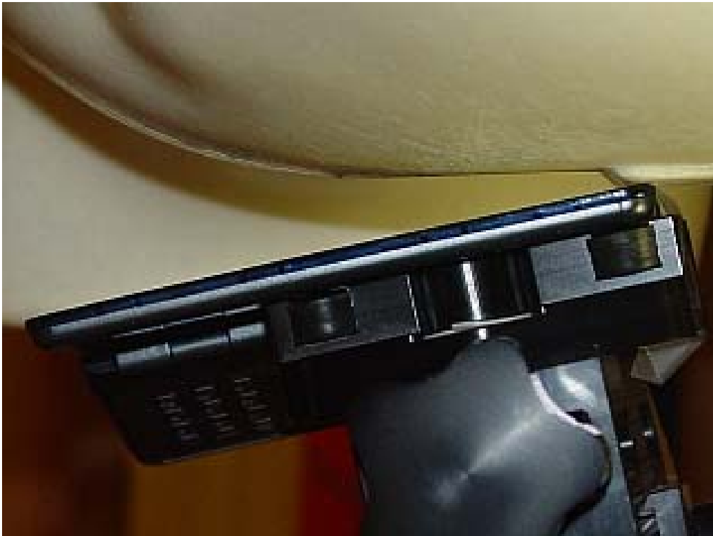
Figure 9E.2 Phone (Open) against the head (Left Tilt position)