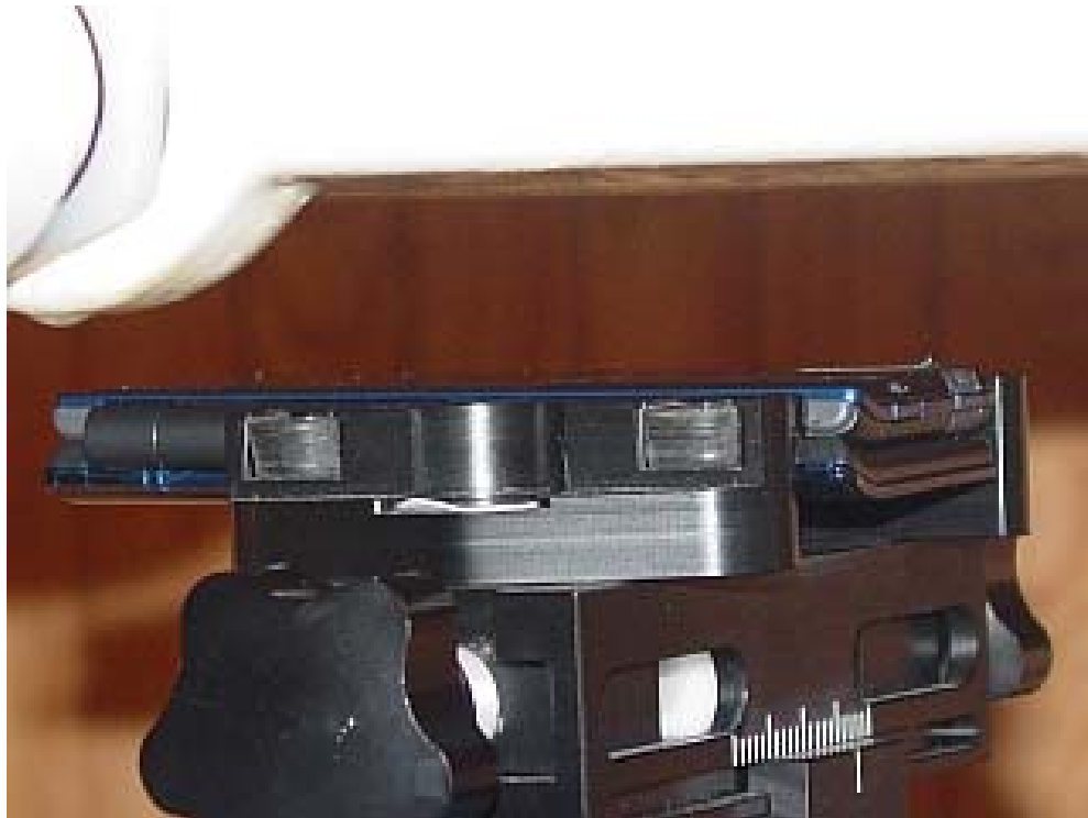
Figure 9E.3 Body SAR setup (Face Down, 22mm Air Separation)