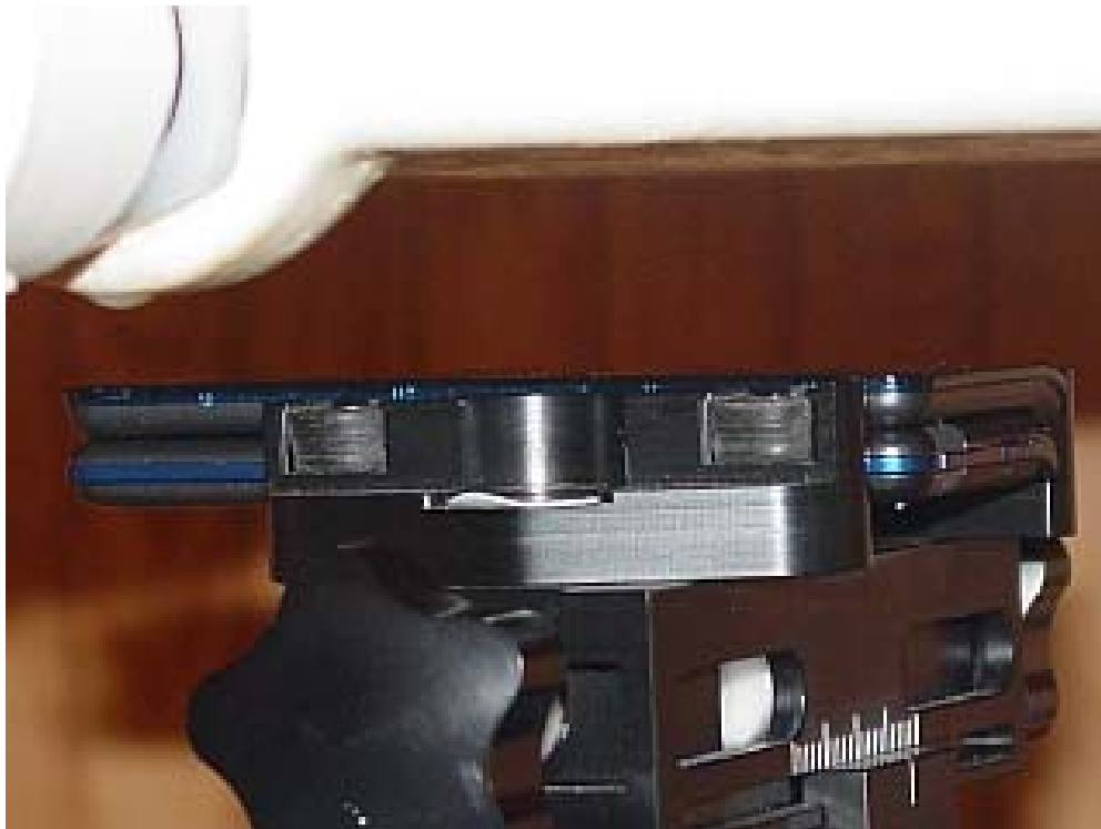
Figure 9E.4 Body SAR setup (Face Up, 22mm Air Separation)