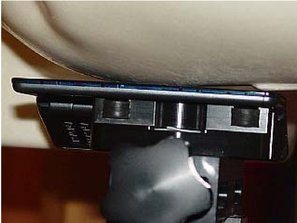
Figure 9E.1 Phone (Open) against the head (Left cheek position)