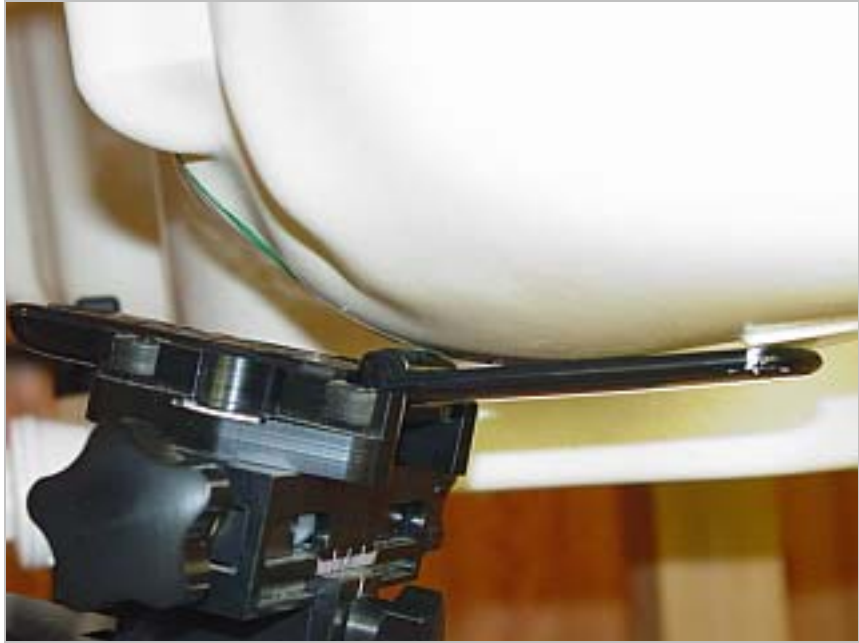
Figure 9E.1 Phone against the head (Left cheek position)