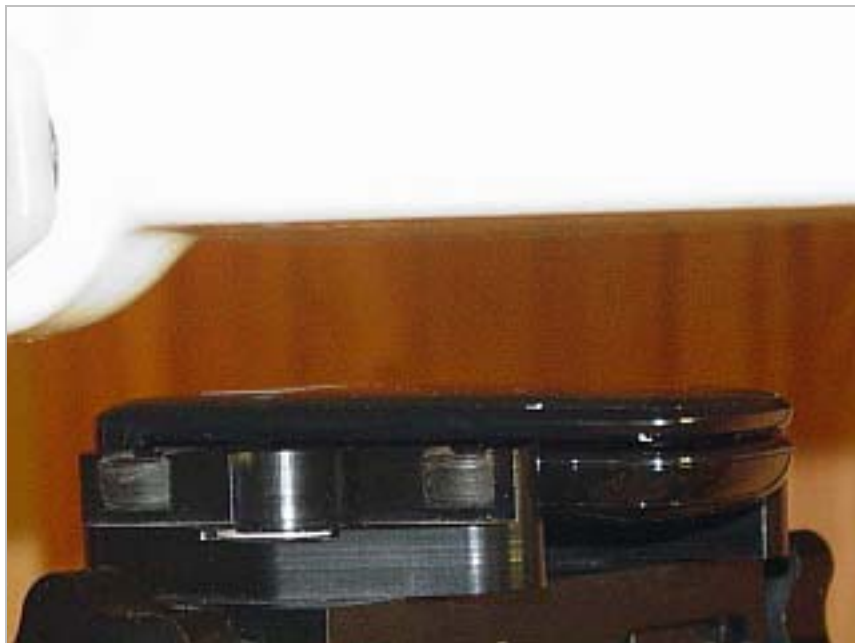
Figure 9E.6 Body SAR setup (Closed, Face Up, 22mm Air Separation)