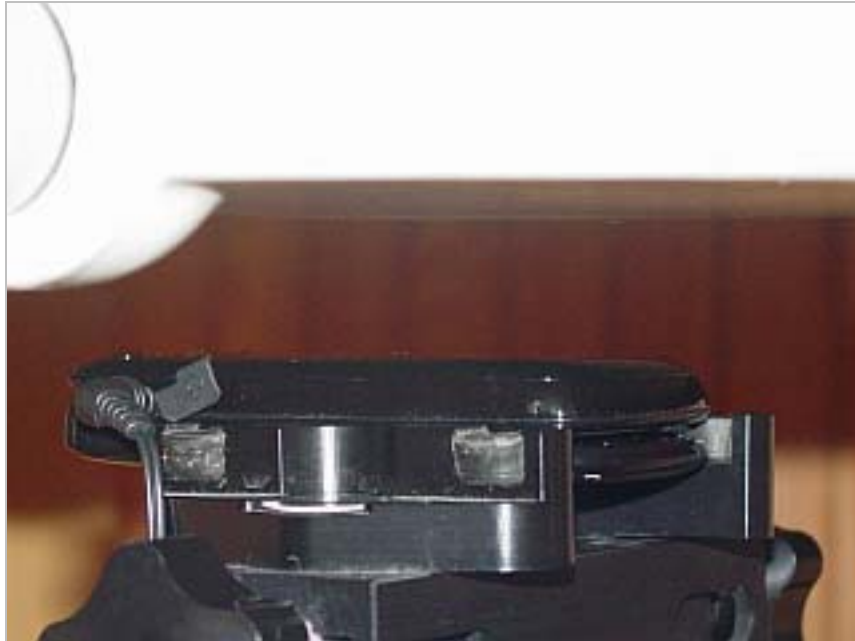
Figure 9E.5 Body SAR setup (Closed, Face Down, 22mm Air Separation)