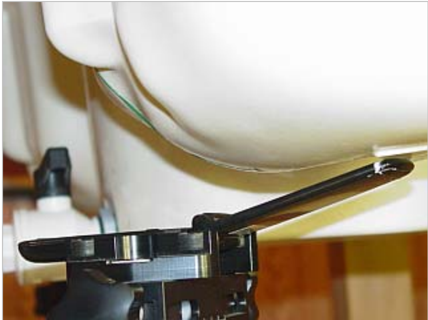
Figure 9E.2 Phone against the head (Left Tilt position)