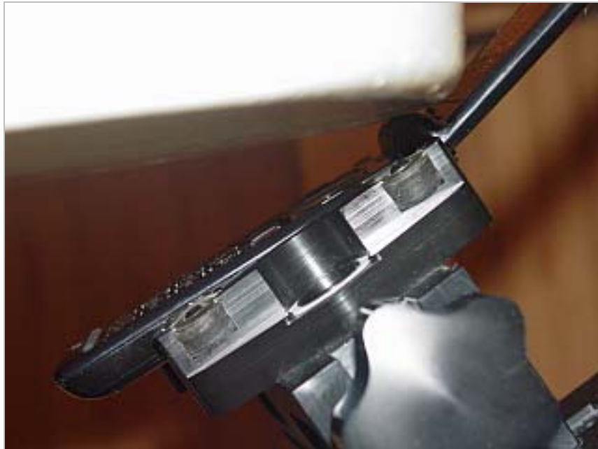
Figure 9E.3 Mouth/Jaw SAR setup