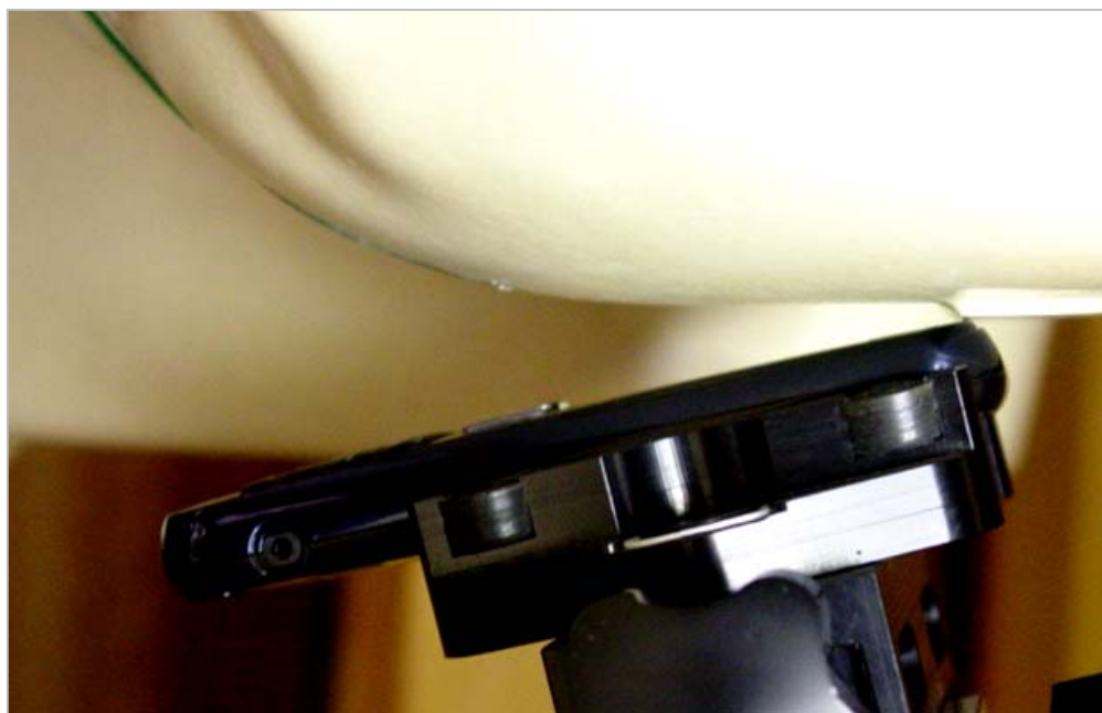
Figure 9E.2 Phone against the head (Left Tilt position)