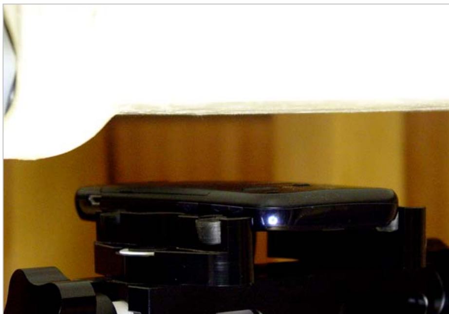
Figure 9E.3 Body SAR setup with Phone Face Down (22mm Air Separation)