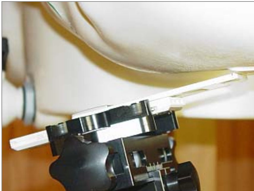
Figure 9E.4 Phone (Open) against the head (Left Tilt position)