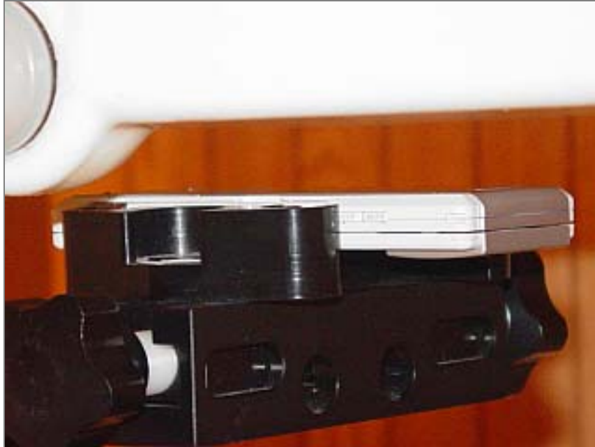
Figure 9E.5 Body SAR setup (Closed, Face Down, 15mm Air Separation)