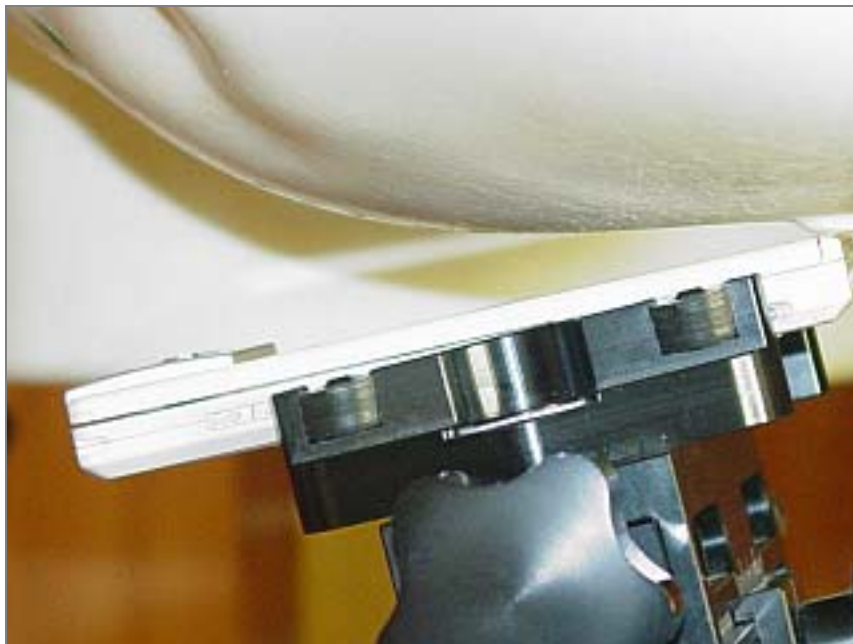
Figure 9E.2 Phone against the head (Left Tilt position)