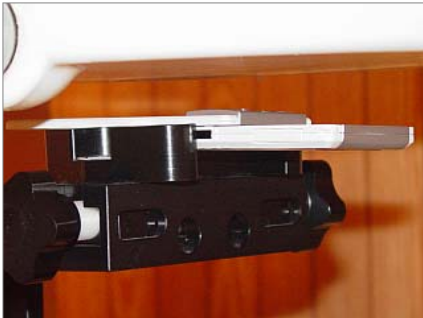
Figure 9E.6 Body SAR setup (Open, Face Up, 15mm Air Separation)