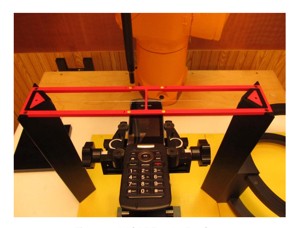
Figure 1a – HAC RF Emission Test Setup