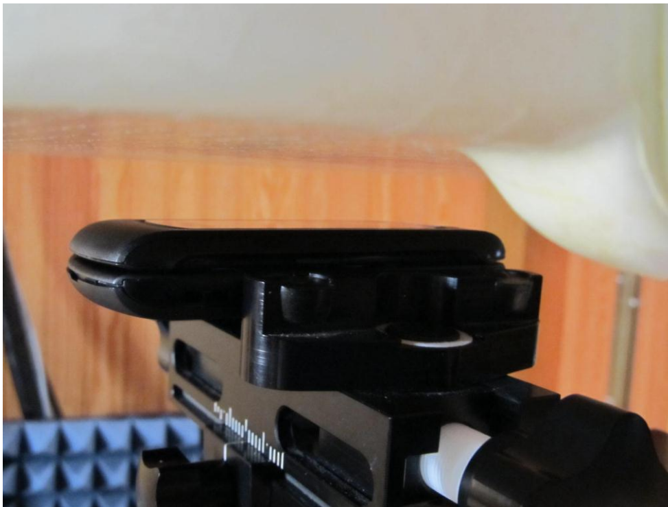
Figure 9E.4 Phone Closed 15mm_Front