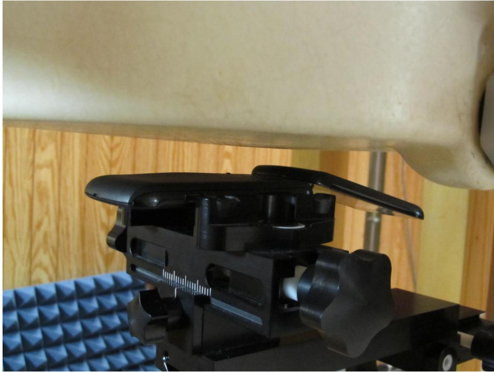
Figure 9E.5 Phone Open 15mm Back