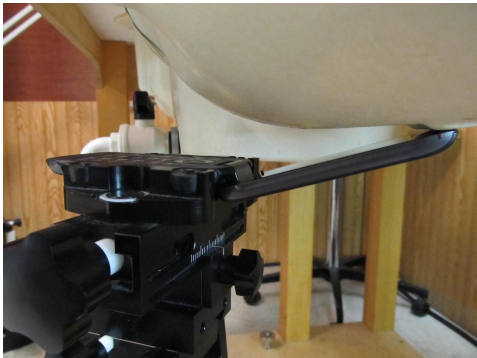
Figure 9E.2 Phone against the head (Left Tilt position)