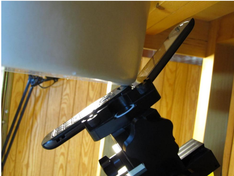
Figure 9E.6 Phone Open Jaw Position