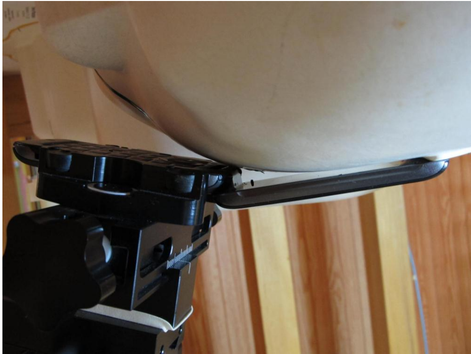
Figure 9E.1 Phone against the head (Left cheek position)