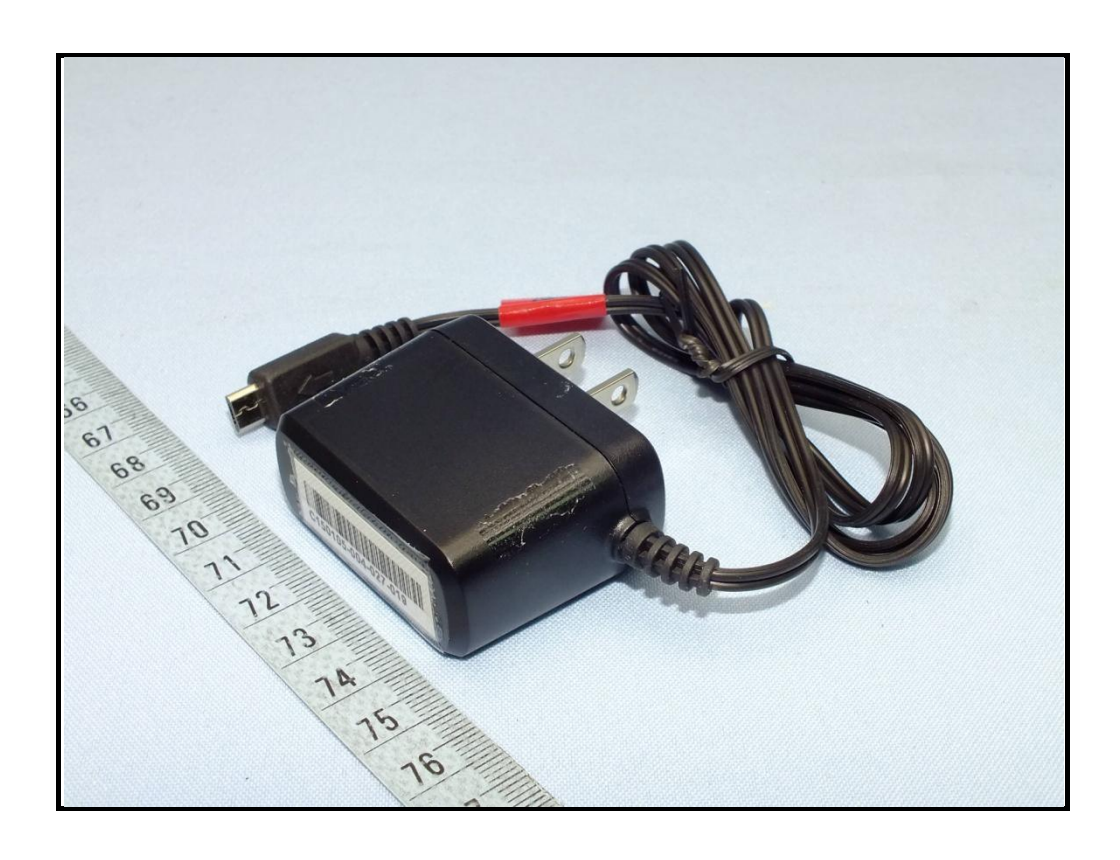
Page 2 of 3