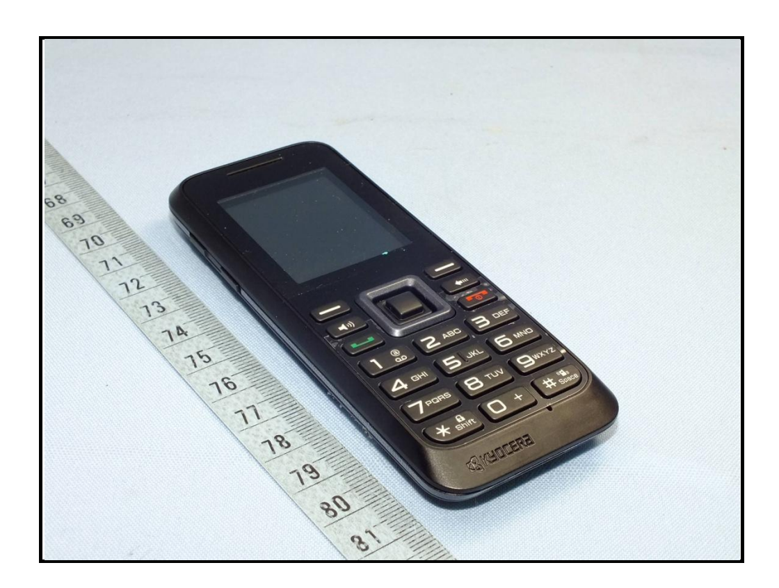
Page 1 of 3