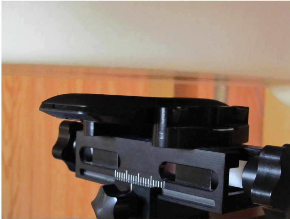
Figure 9E.3 Phone 15mm Back