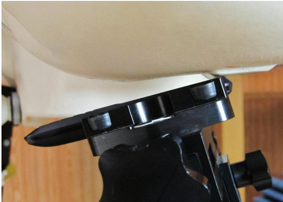
Figure 9E.2 Phone against the head (Left Tilt position)