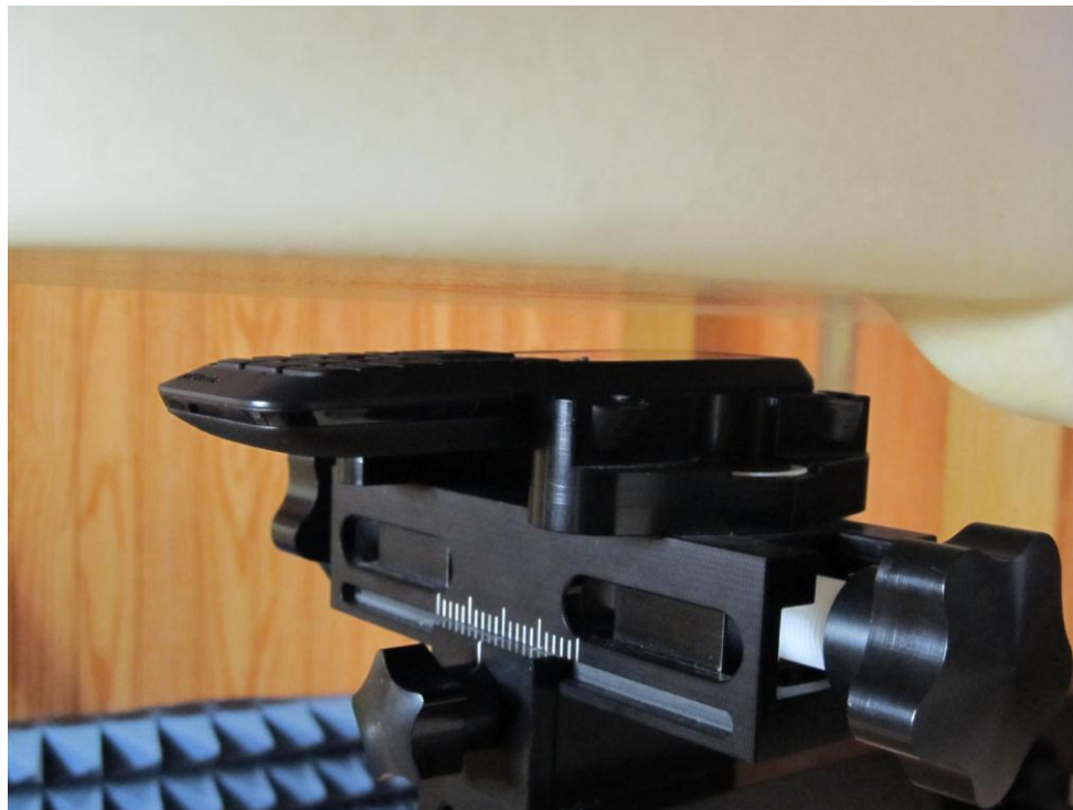
Figure 9E.4 Phone 15mm_Front