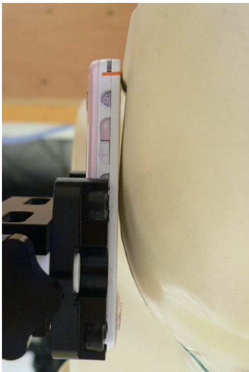
Fig. 21: Cheek position, right side.