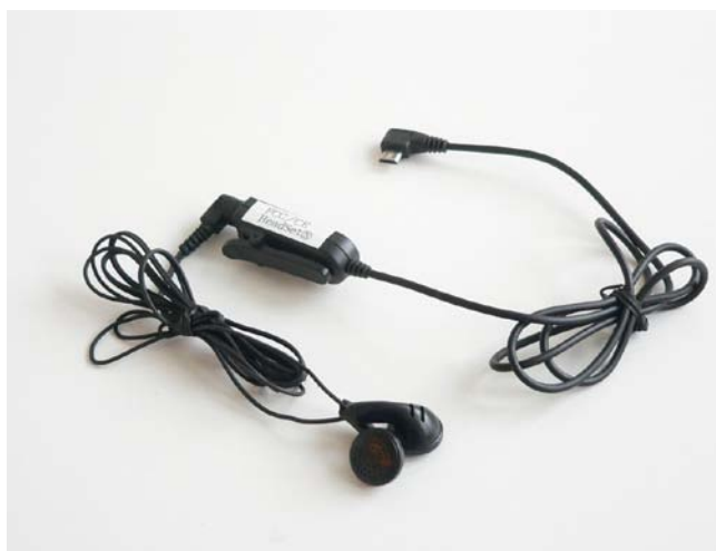
Fig. 18: Pictures of the used headset under test.