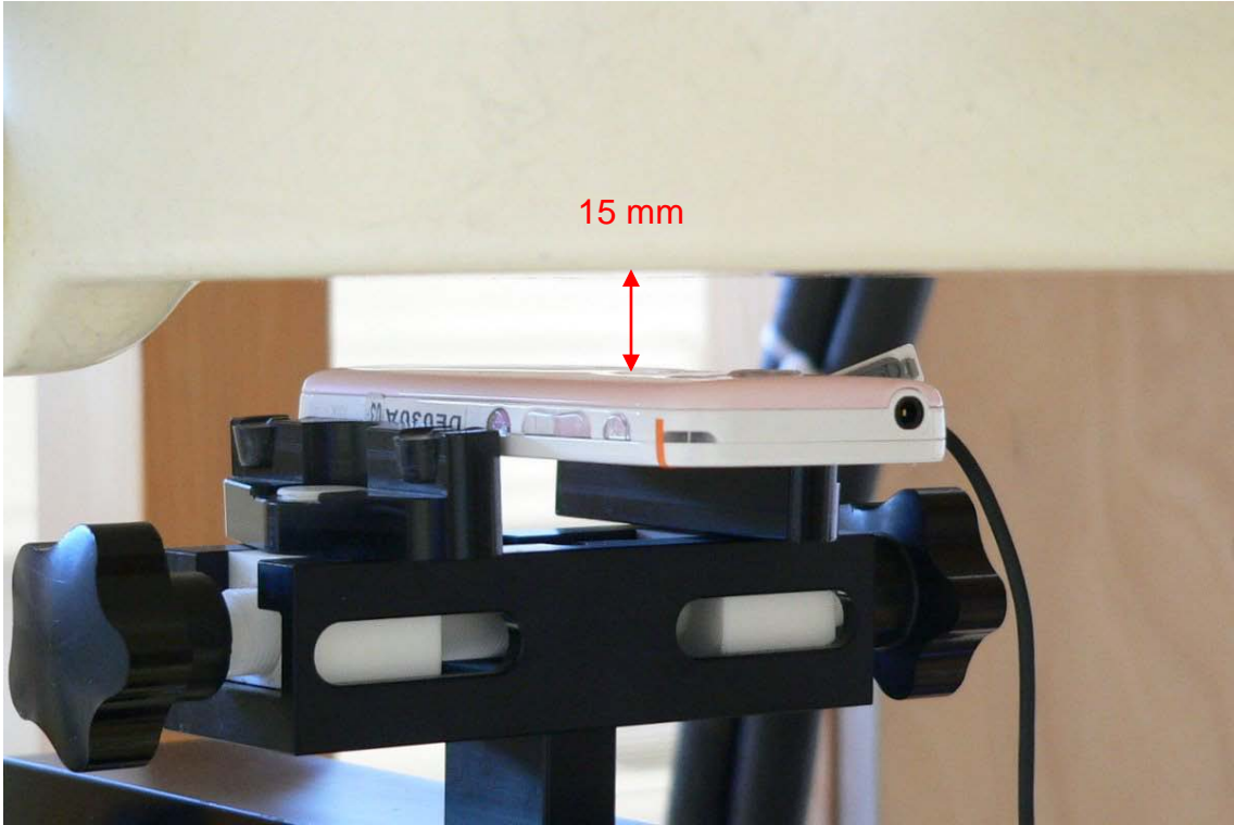
Fig. 24: Body worn configuration, position 2, display towards the ground, headset attached, 15 mm distance.