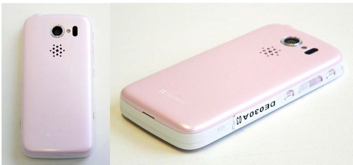
Fig. 17: Back and side view of the Kyocera F42.