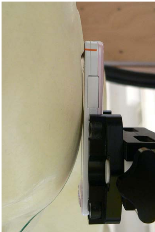
Fig. 19: Cheek position, left side.

Figure 19 - 24 show the test positions for the SAR measurements for the Kyocera F42.