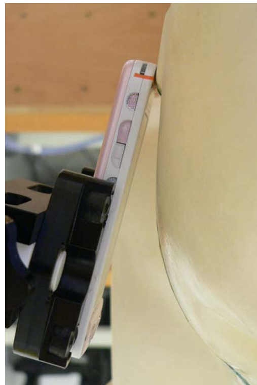
Fig. 22: Tilted position, right side.