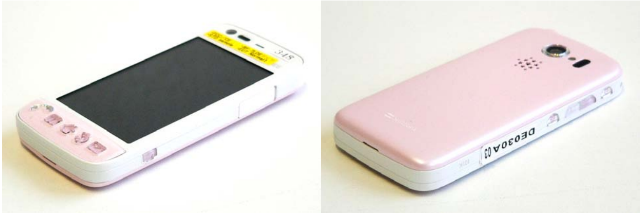
Fig. 1: Pictures of the device under test.