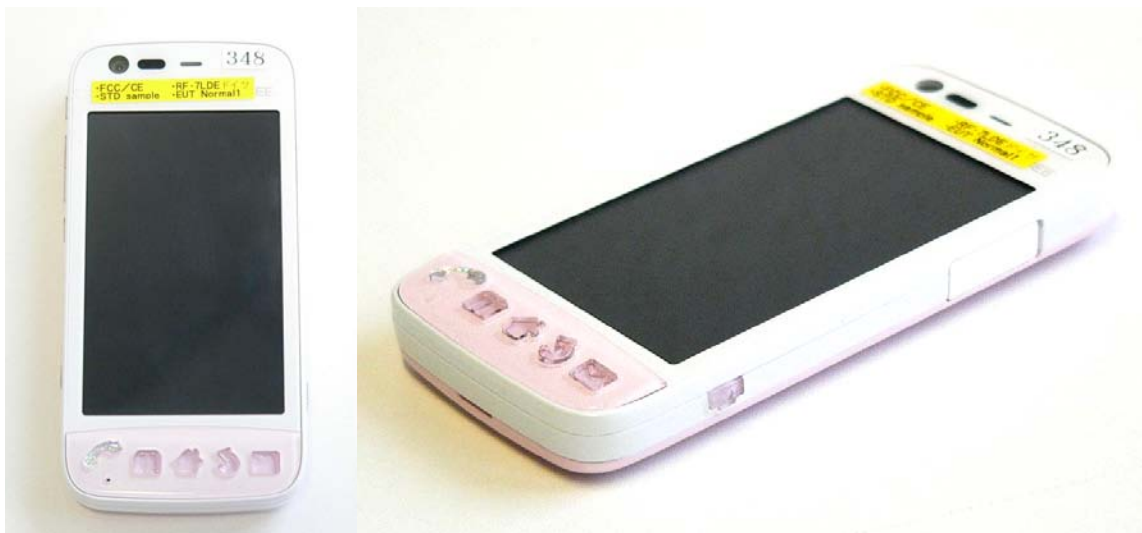
Fig. 16: Front and side view of the Kyocera F42.

Figure 16 - 18 show the device under test and the used accessories.