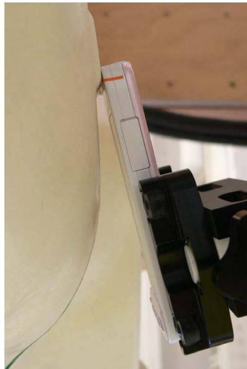
Fig. 20: Tilted position, left side.