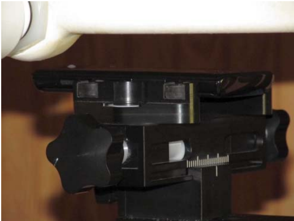
Figure 9E.4 Body SAR setup (Face Up, 22mm Air Separation)