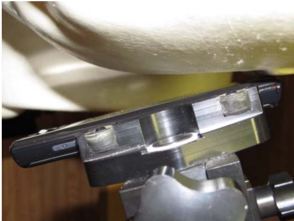
Figure 9E.2 Phone against the head (Left Tilt position)