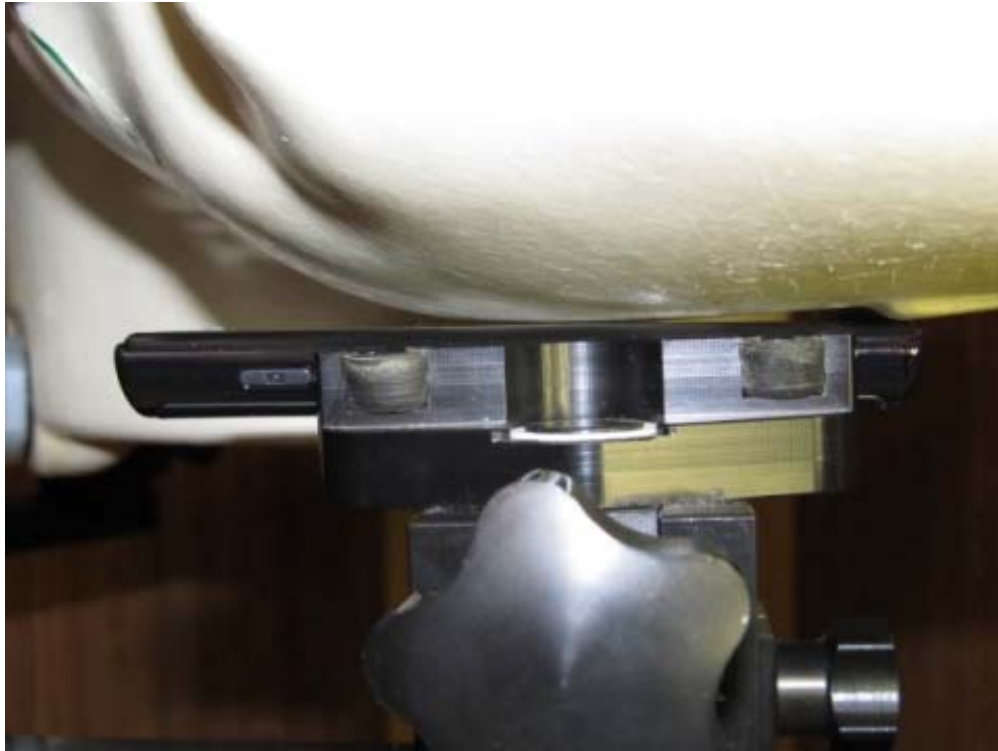
Figure 9E.1 Phone against the head (Left cheek position)