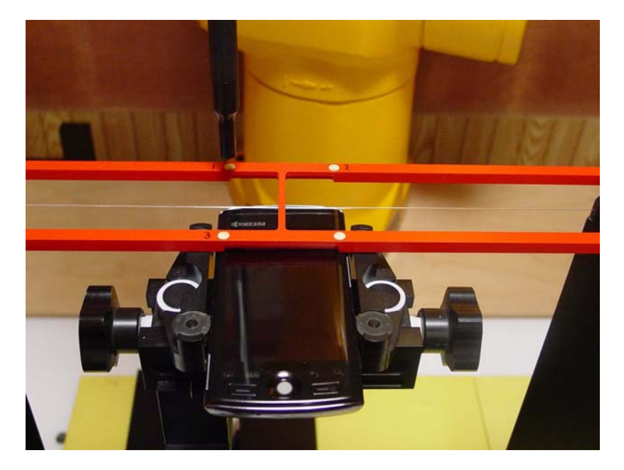
Figure 1a – HAC RF Emission Test Setup