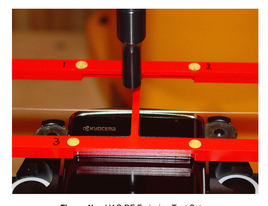
Figure 1b - HAC RF Emission Test Setup