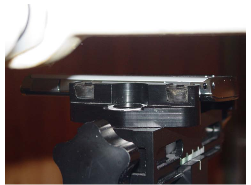
Figure 9E.3 Body SAR setup (Face Down, 22mm Air Separation)