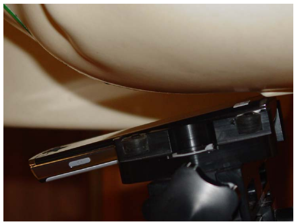
Figure 9E.2 Phone against the head (Left Tilt position)