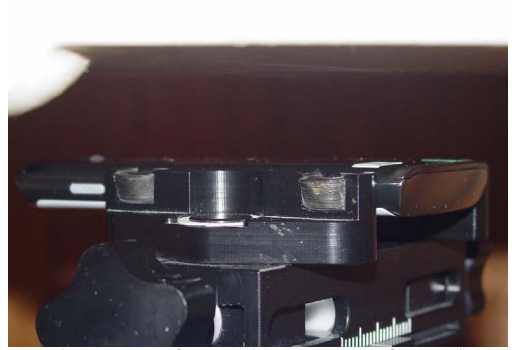
Figure 9E.4 Body SAR setup (Face Up, 22mm Air Separation)