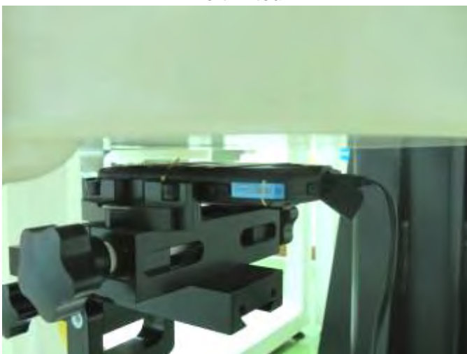
Rear Face of EUT with 1 cm Gap (Body-Worn Mode)