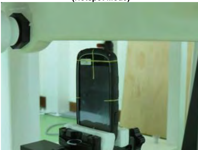
Top Side of EUT with 1 cm Gap (Hotspot Mode)