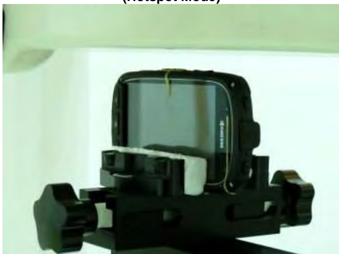
Left Side of EUT with 1 cm Gap (Hotspot Mode)