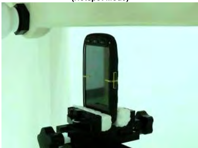
Bottom Side of EUT with 1 cm Gap (Hotspot Mode)