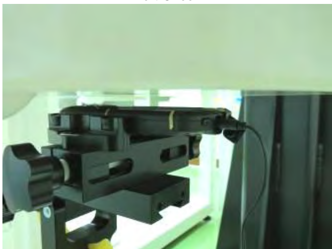
Front Face of EUT with 1 cm Gap (Body-Worn Mode)