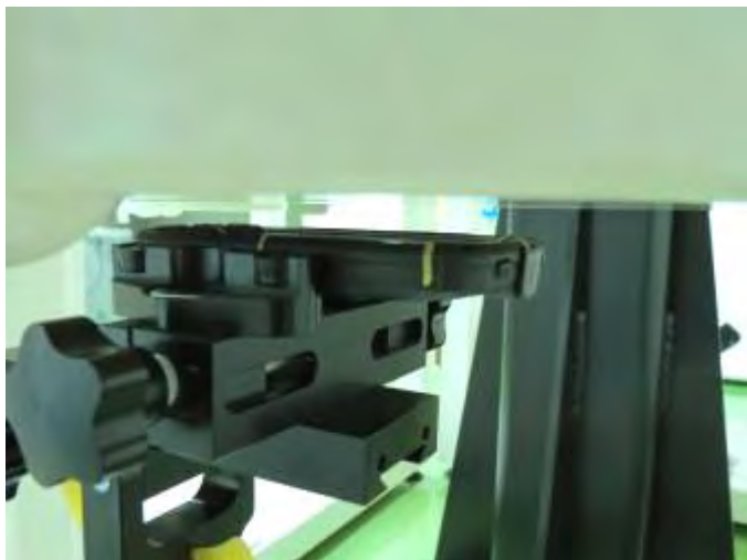
Front Face of EUT with 1 cm Gap (Hotspot Mode)