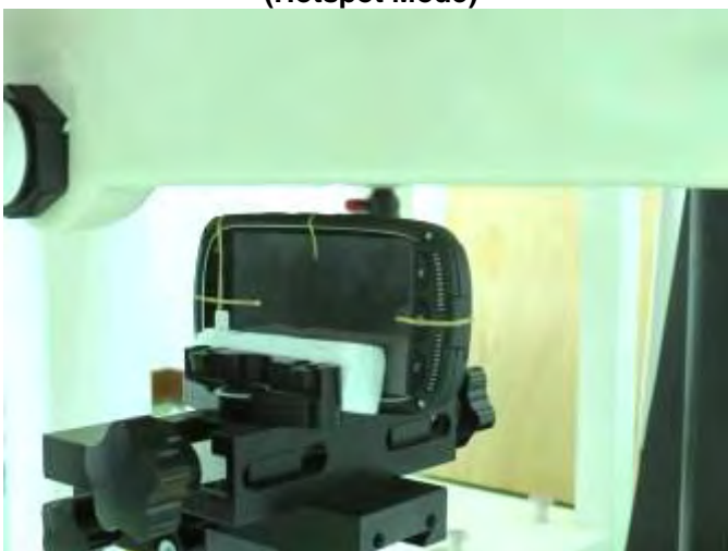
Right Side of EUT with 1 cm Gap (Hotspot Mode)