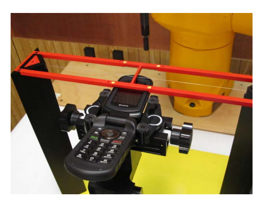
Figure 1a - HAC RF Emission Test Setup