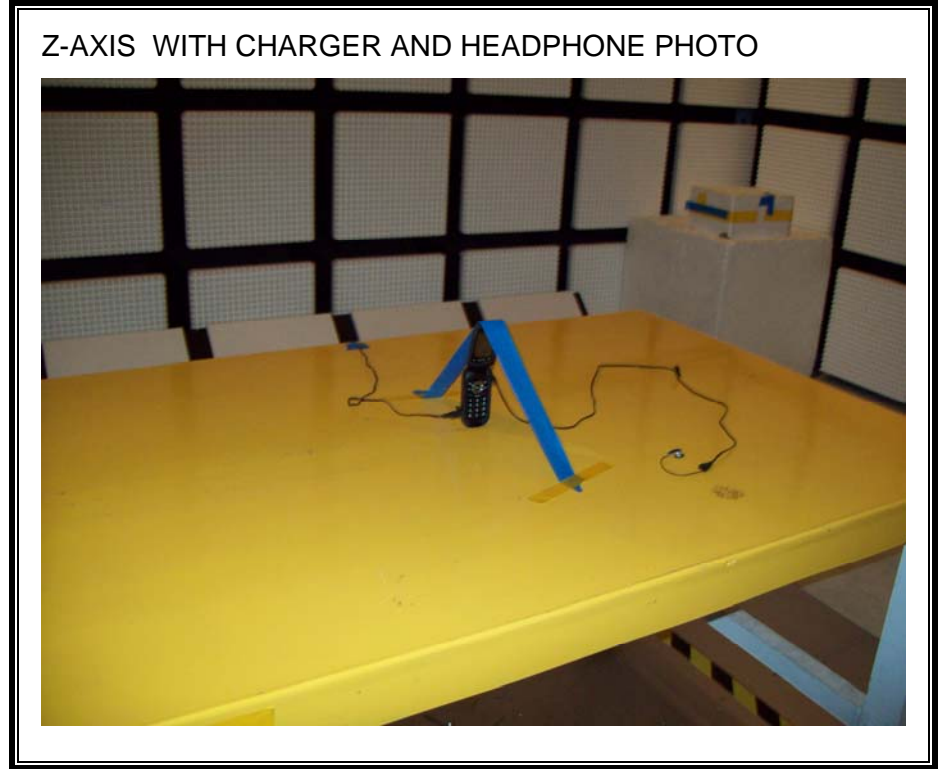
Page 18 of 19