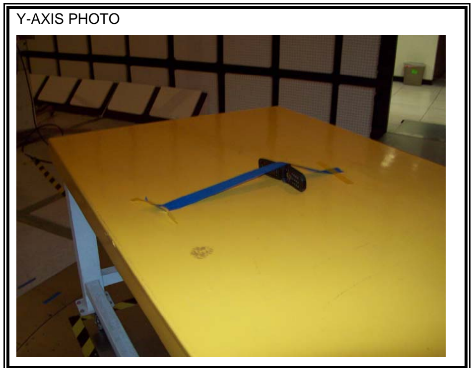
Page 17 of 19