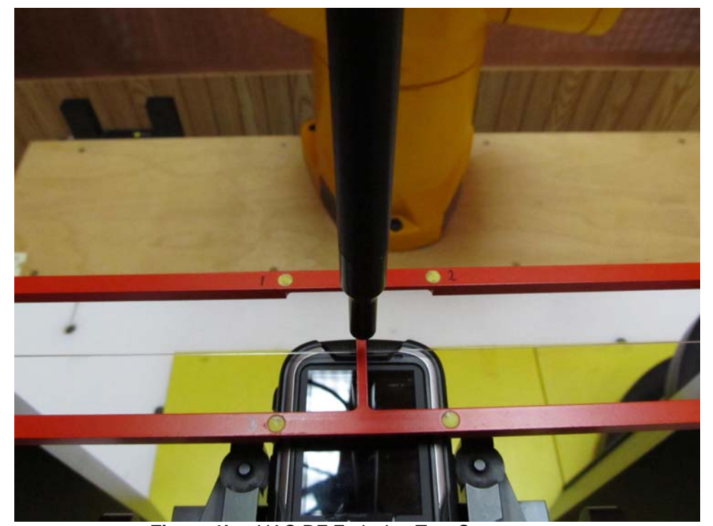
Figure 1b - HAC RF Emission Test Setup