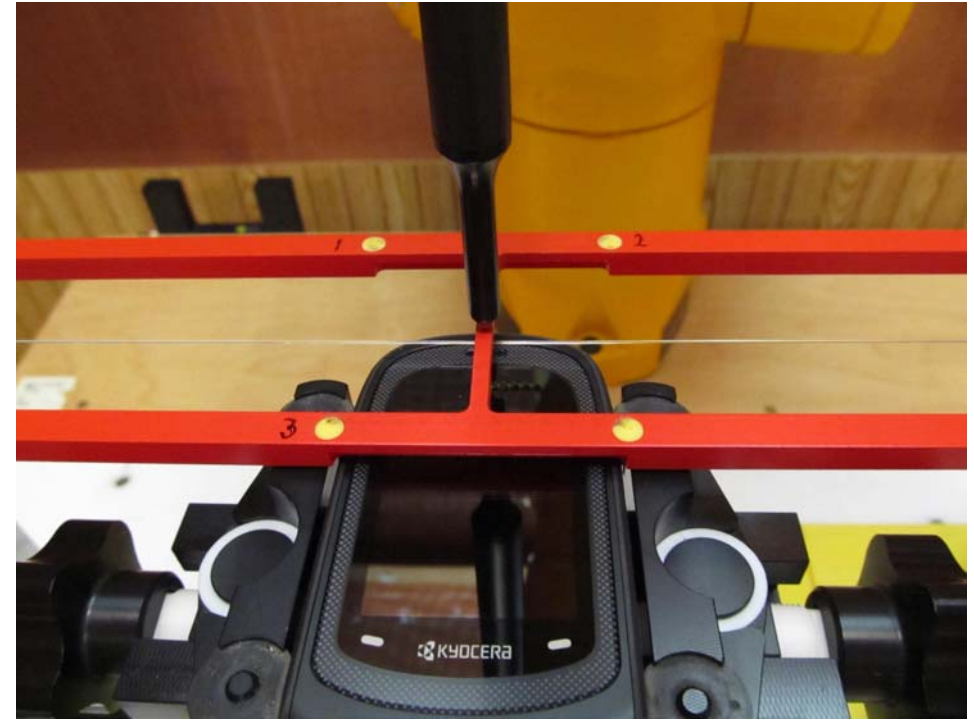
Figure 1b - HAC RF Emission Test Setup