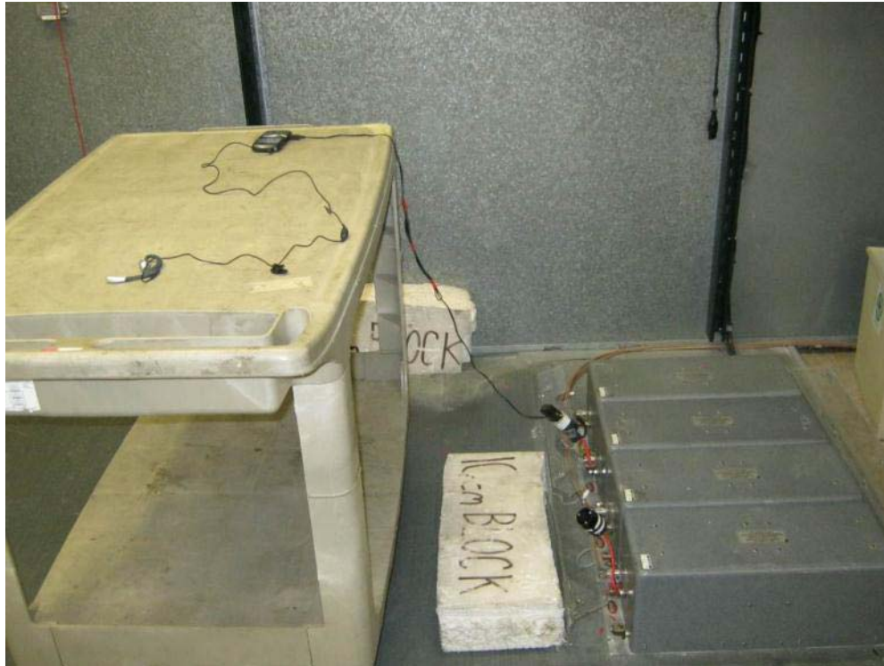
Test Setup example shown