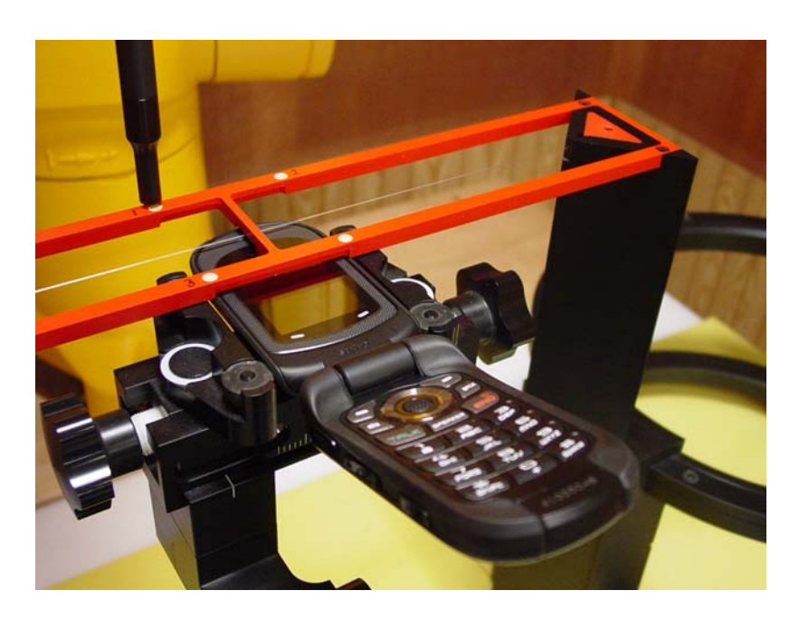
Figure 1a – HAC RF Emission Test Setup