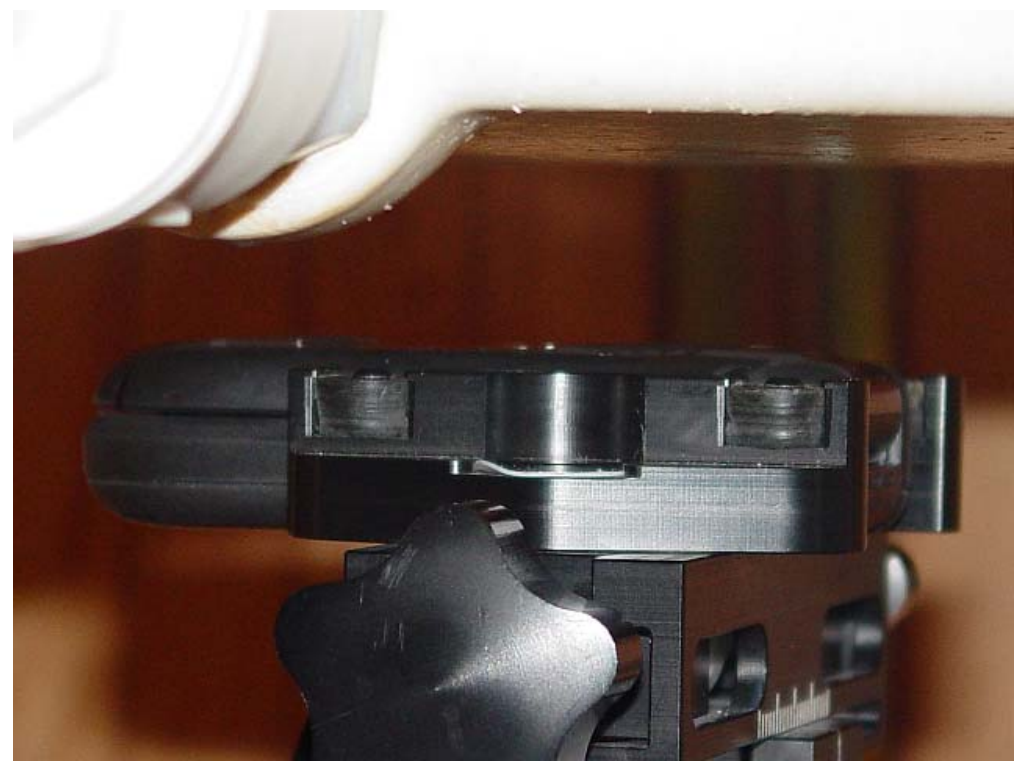
Figure 9E.5 Body SAR setup (Closed, Face Up, 22mm Air Separation)