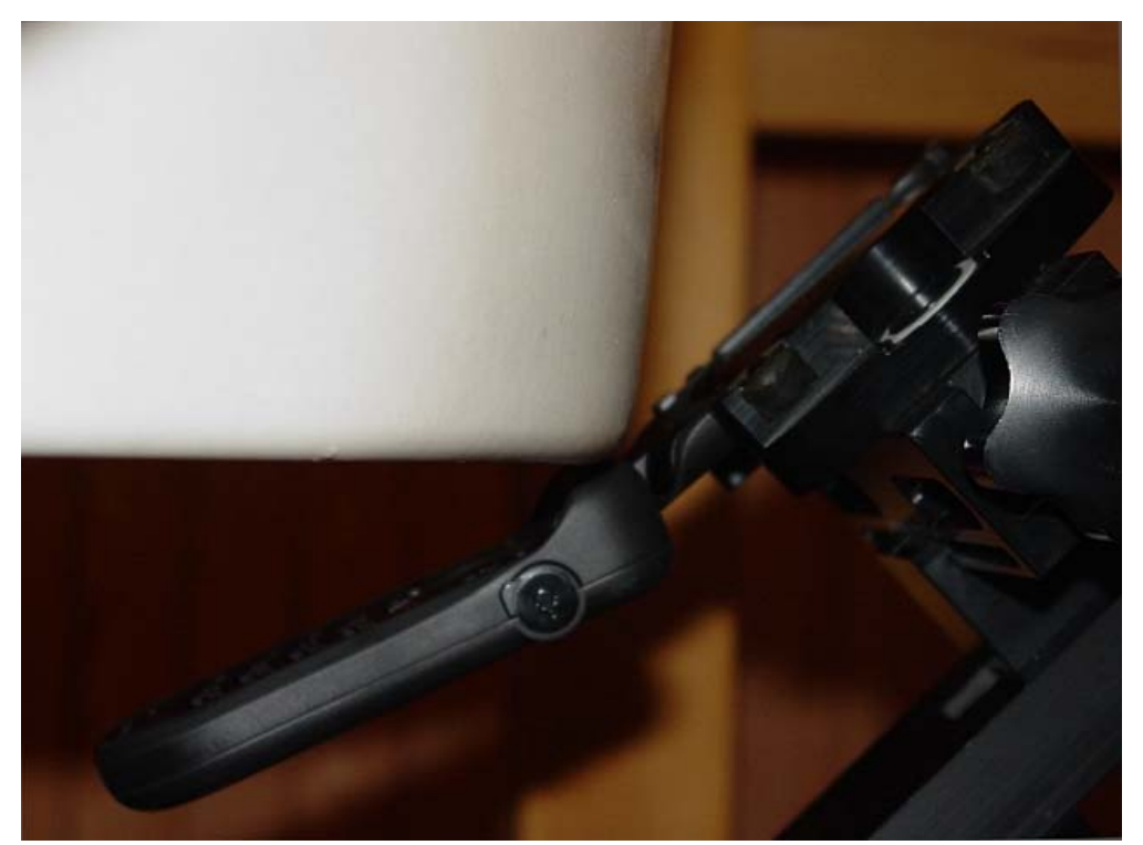
Figure 9E.3 Phone (Open) Mouth/Jaw position