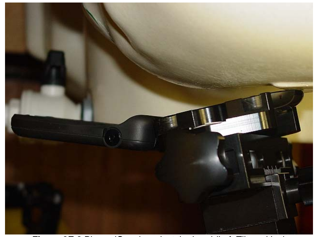
Figure 9E.2 Phone (Open) against the head (Left Tilt position)