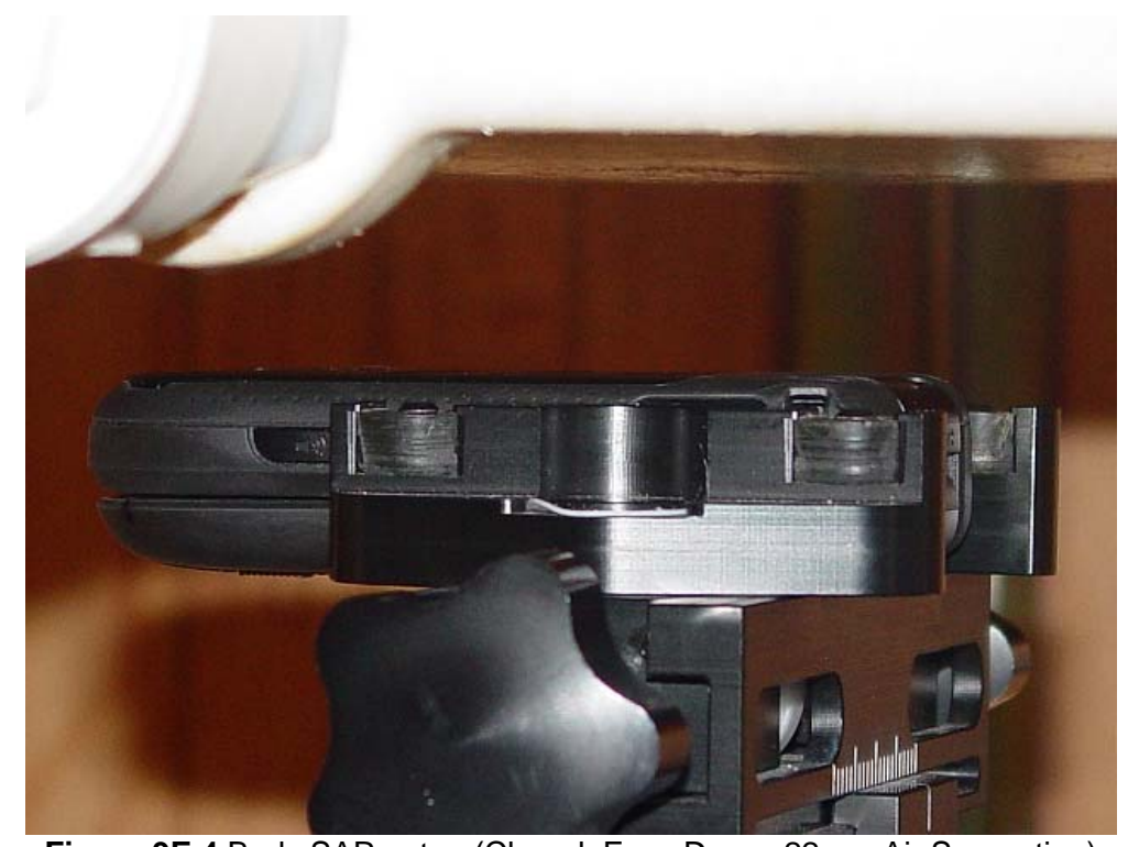
Figure 9E.4 Body SAR setup (Closed, Face Down, 22mm Air Separation)