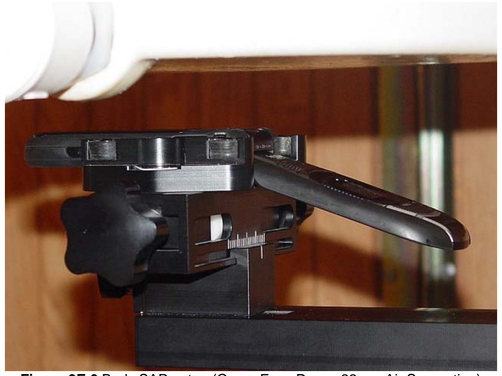
Figure 9E.6 Body SAR setup (Open, Face Down, 22mm Air Separation)