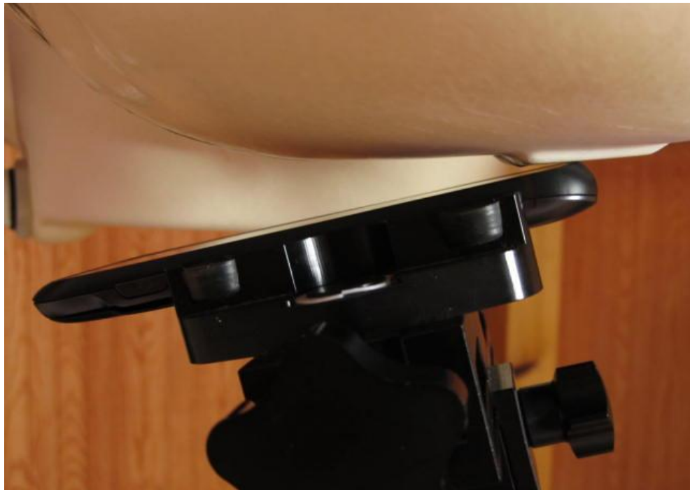
Figure 9E.2 Phone against the head (Left Tilt position)