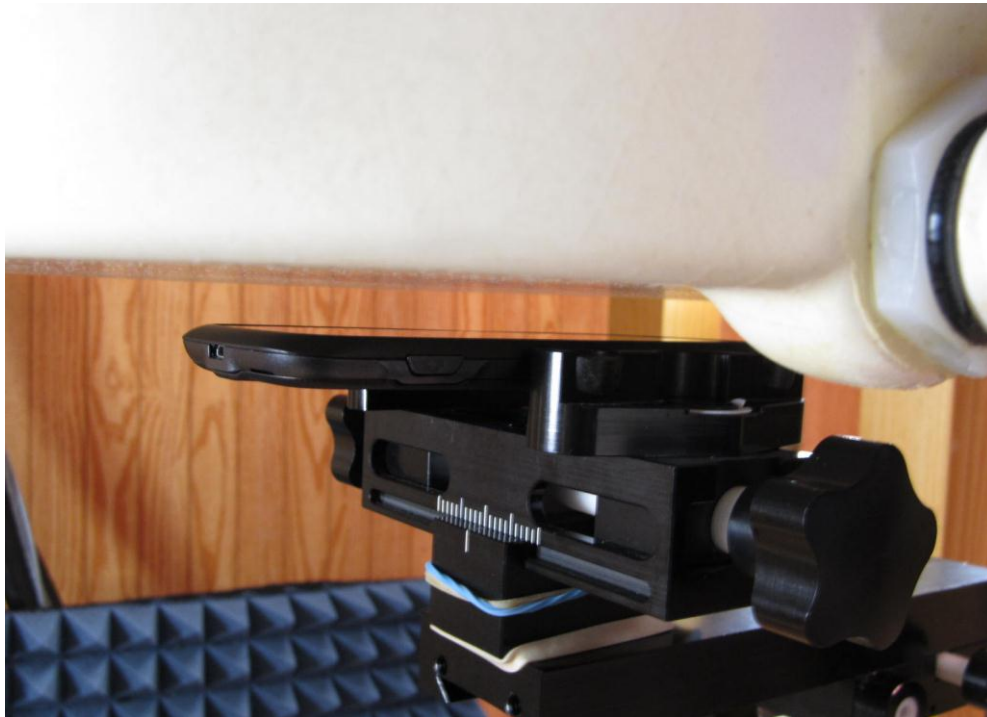
Figure 9E.4 Phone 10mm Front