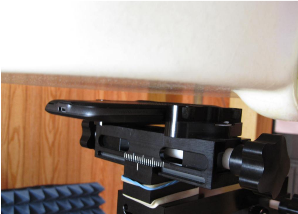
Figure 9E.3 Phone 10mm Back