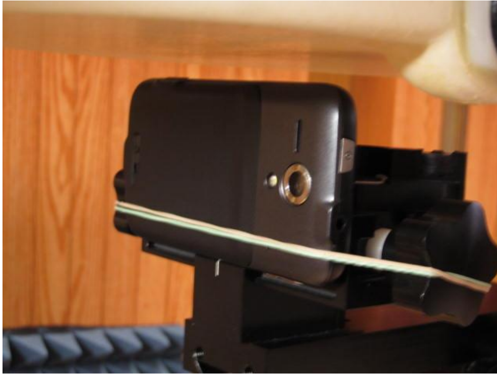
Figure 9E.5 Phone 10mm Left