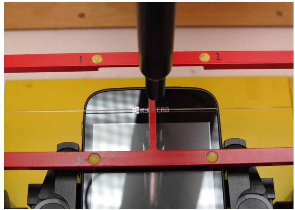
Figure 1b - HAC RF Emission Test Setup