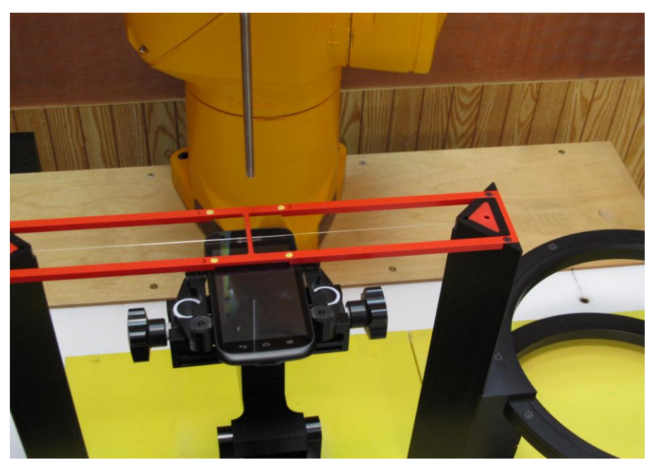
Figure 1a - HAC Tcoil Emission Test Setup