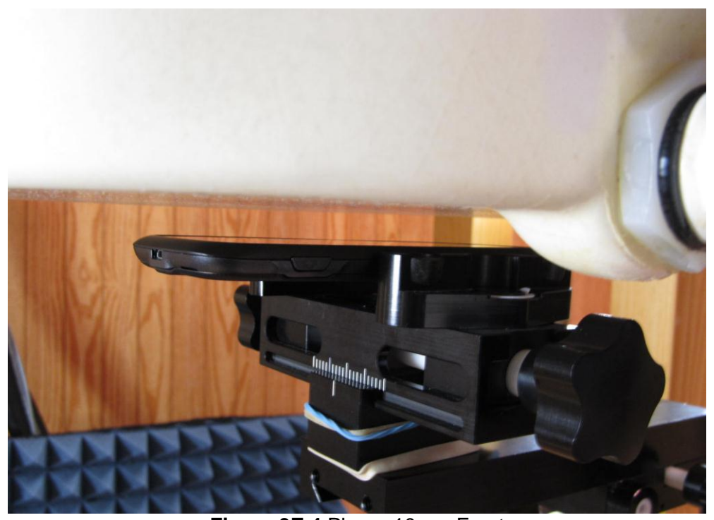
Figure 9E.4 Phone 10mm Front