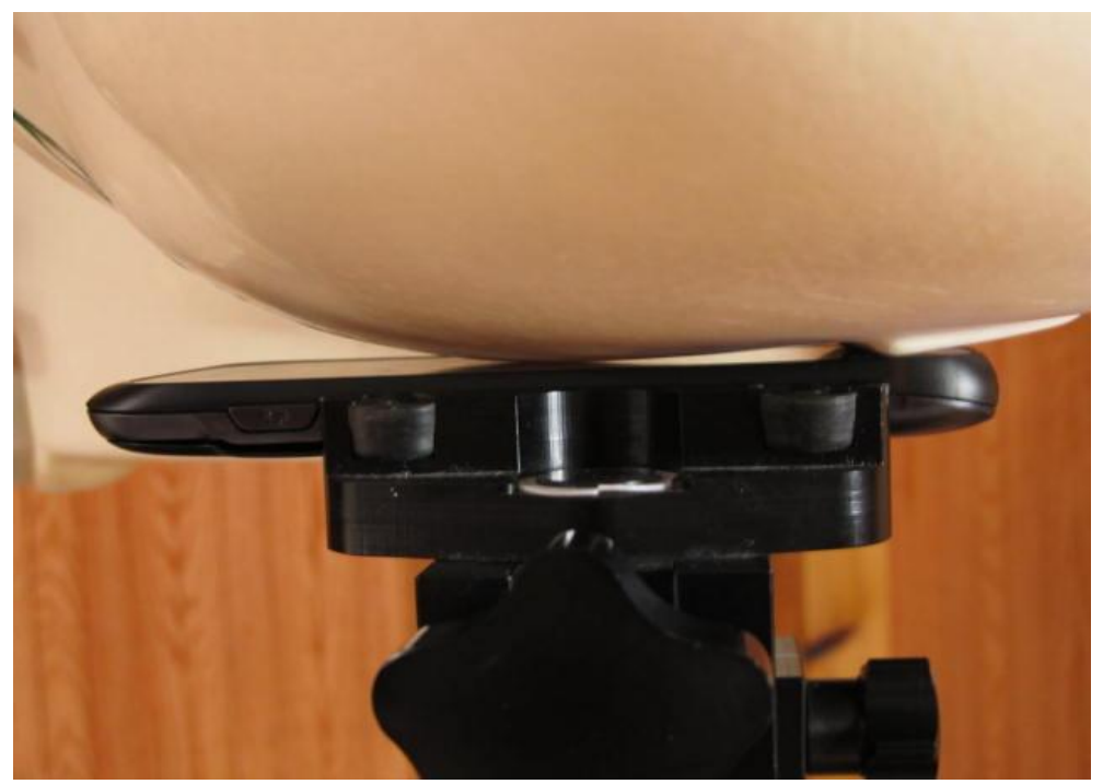
Figure 9E.1 Phone against the head (Left cheek position)