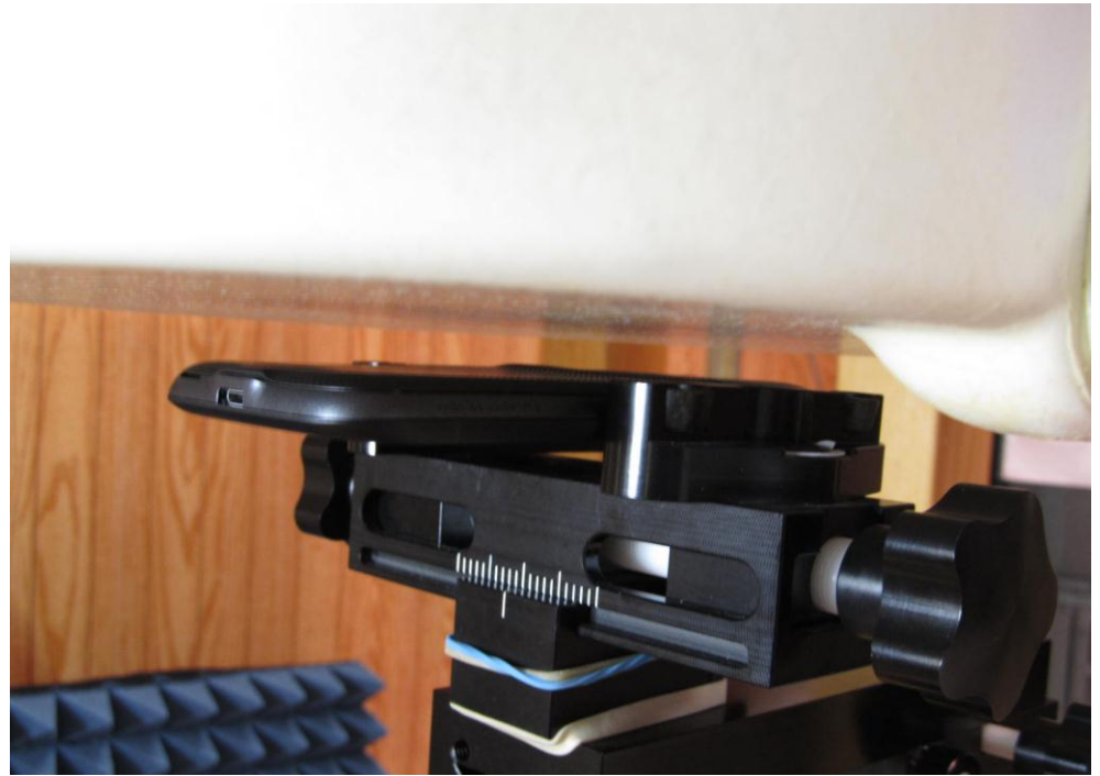
Figure 9E.3 Phone 10mm Back