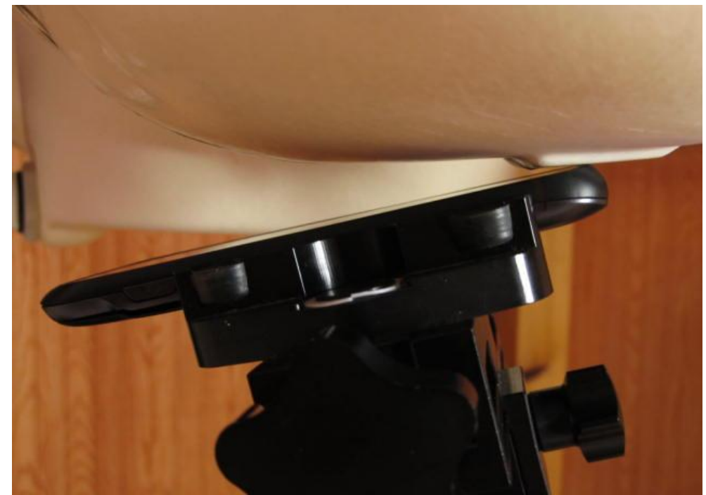
Figure 9E.2 Phone against the head (Left Tilt position)