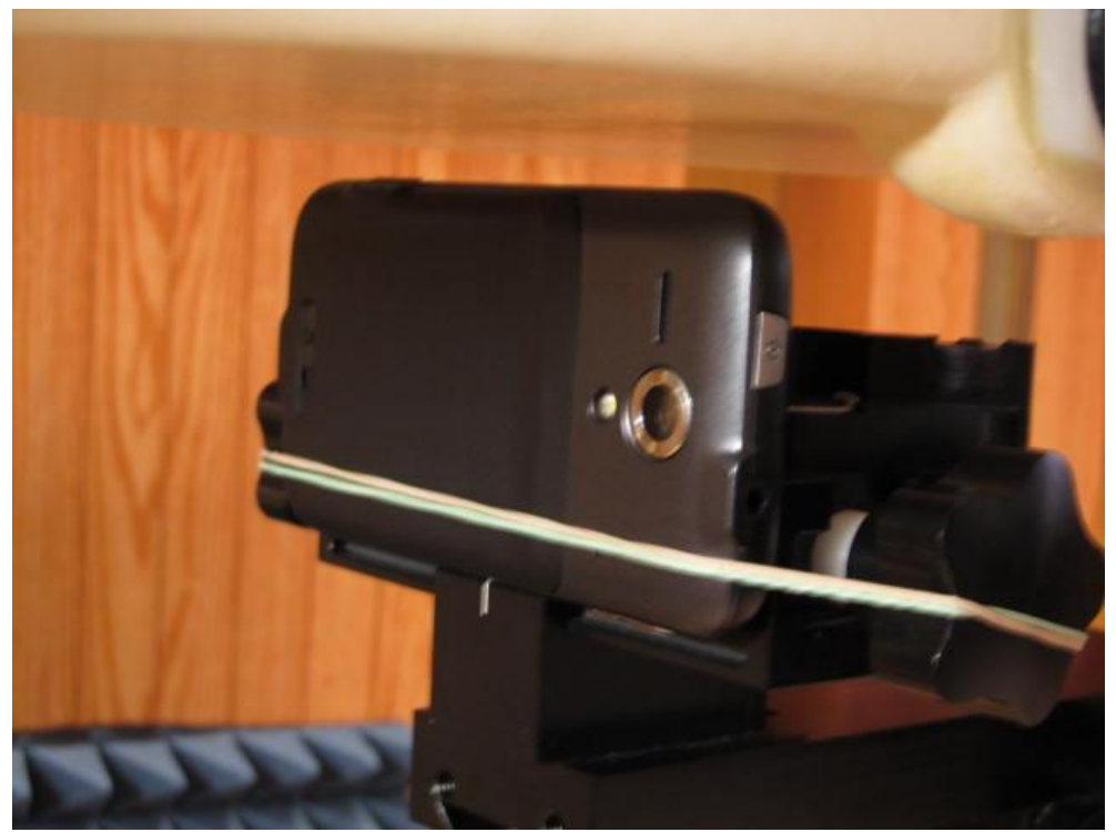
Figure 9E.5 Phone 10mm Left