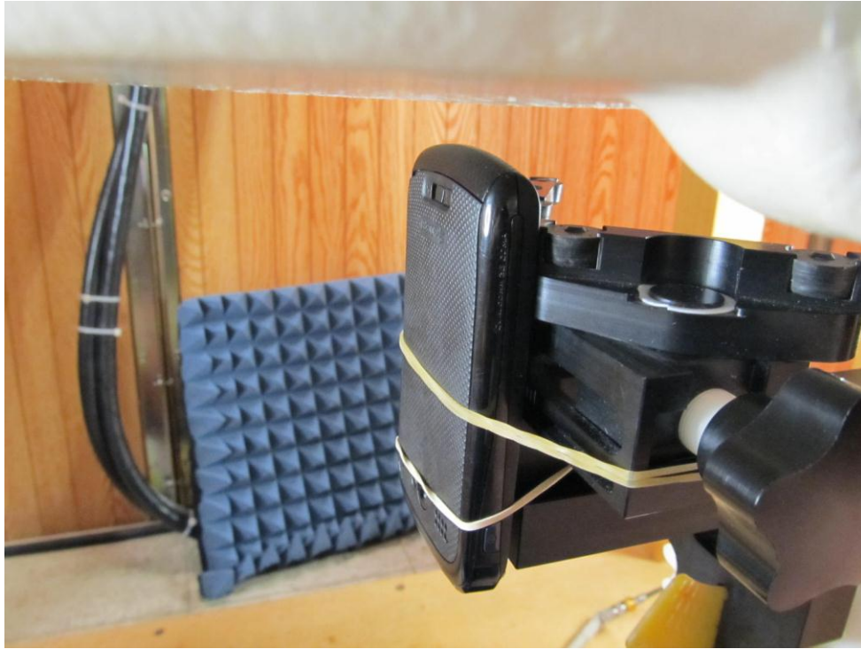
Figure 9E.9 Phone BOTTOM_10 mm