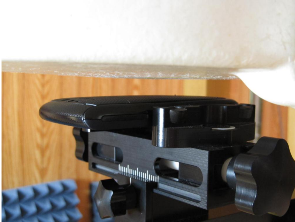
Figure 9E.5 Phone 10mm_Back