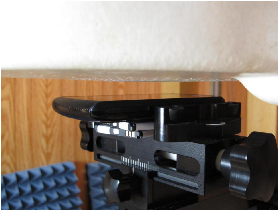
Figure 9E.6 Phone 10mm_Front