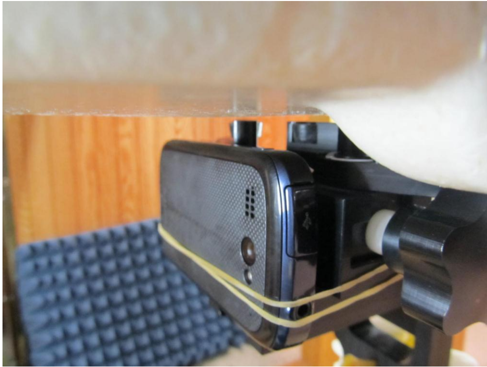
Figure 9E.7 Phone LEFT_10 mm