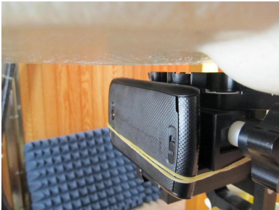
Figure 9E.8 Phone RIGHT_10 mm