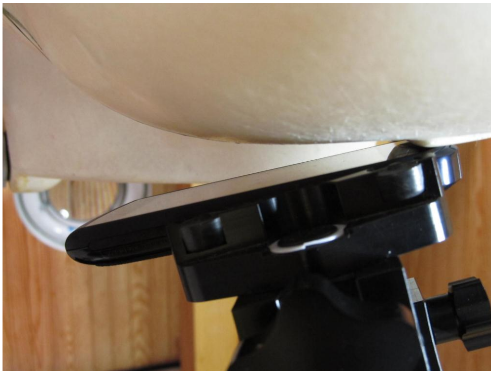
Figure 9E.2 Phone against the head (Left Tilt position)