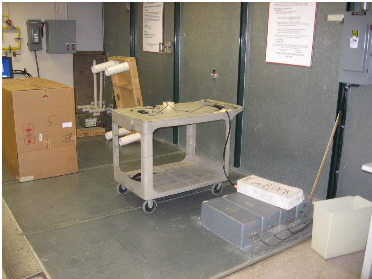
Test Setup Example Shown