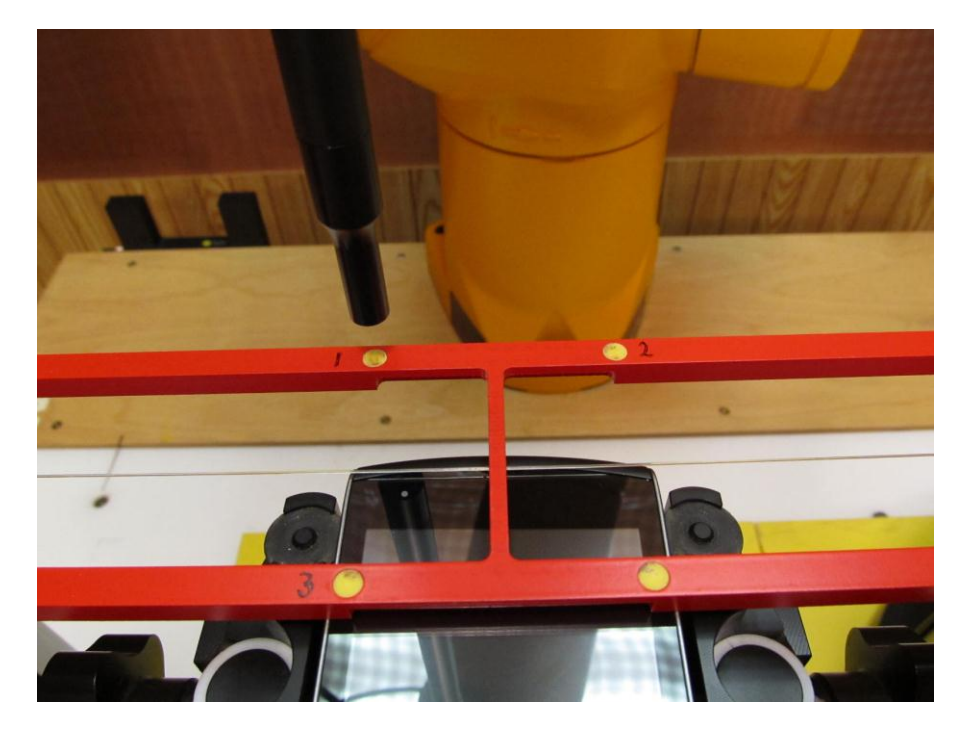
Figure 1b - HAC RF Emission Test Setup