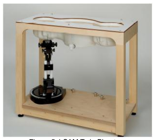
Figure 5.4 SAM Twin Phantom

The thickness of phantom shell is 2mm except for the ear, where an integrated ear spacer provides 6mm spacing from the tissue boundary. Manufacturer reports tolerance in shell thickness to be \pm 0.1mm.