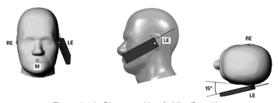
Figure 7.1d - Phone position 2, "tilted" position.

In the "cheek position", if the earpiece of the device is not in full contact with the phantom's ear spacer and the peak SAR location for the "cheek position" is located at the ear spacer region or corresponds to the earpiece region of the handset, the device is returned to the "initial ear position" by rotating it away from the mouth until the earpiece is in full contact with the ear spacer. Otherwise, the device is moved away from the cheek perpendicular to the line passes through both "ear reference points" for approximate 2-3cm. While it is in this position, the device is tilted away from the mouth with respect to the "test device reference point" by 15°. After the tilt, it is then moved back toward the head perpendicular to the line passes through both "ear reference point" until the device touches the phantom or the ear spacer. If the antenna touches the head first, the positioning process is repeated with a tilt angle less than 15° so that the device and its antenna would touch the phantom simultaneously.