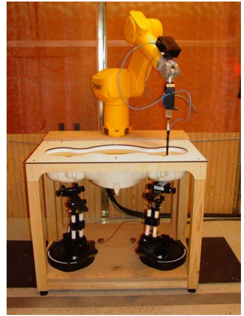
Figure 5.1 DASY 4 System

The calibration records of E-field probe and dipoles are attached in Appendix C and Appendix D respectively.