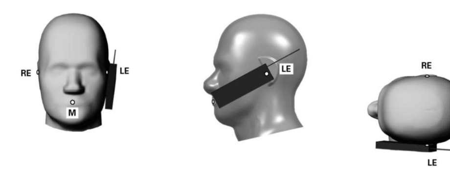
Figure 7.1c - Phone position 1, "cheek" or "touch" position.

"Initial ear position" alignments are maintained and the device is brought toward the mouth of the head phantom by pivoting along the "Neck-Front" line until any point on the display, keypad or mouthpiece portions of the handset is in contact with the phantom or when any portion of a foldout, sliding or similar keypad cover opened to its intended self-adjusting normal use position is in contact with the cheek or mouth of the phantom.