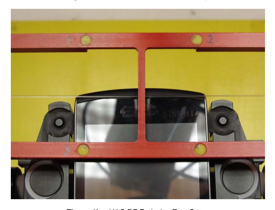
Figure 1b - HAC RF Emission Test Setup