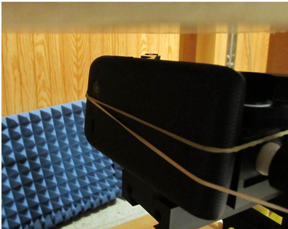
Figure 9E.8 Phone RIGHT_10 mm