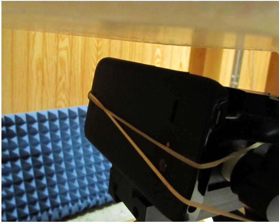
Figure 9E.7 Phone LEFT_10 mm