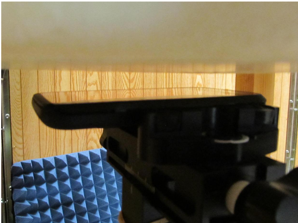
Figure 9E.4 Phone 15mm_Front