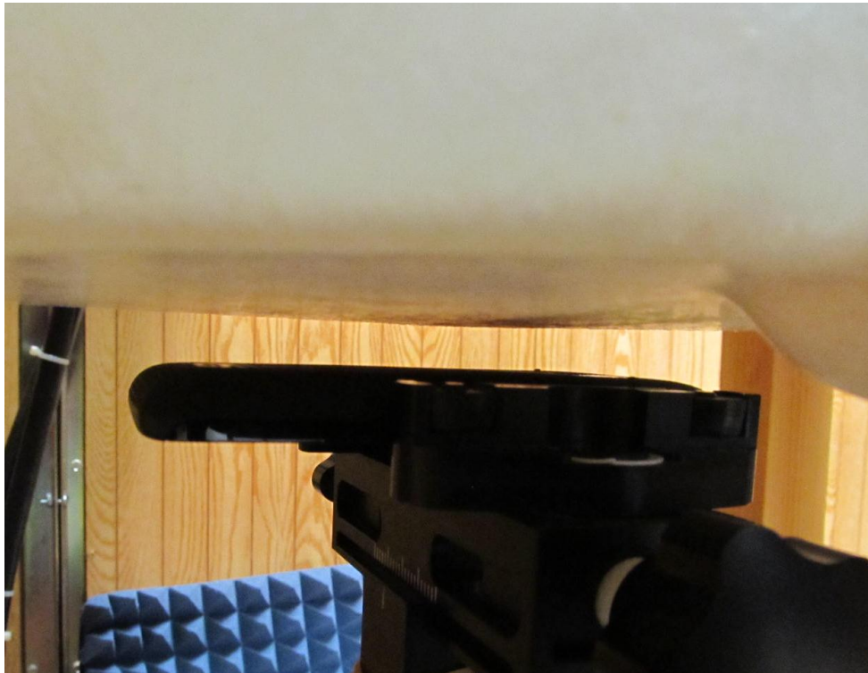
Figure 9E.5 Phone 10mm_Back