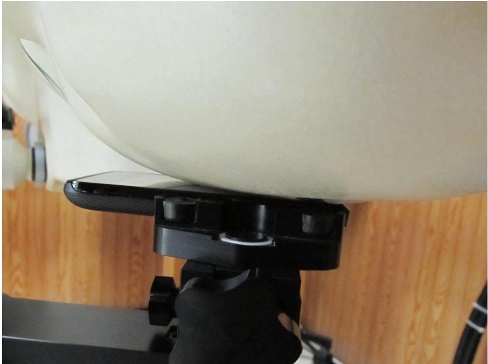
Figure 9E.1 Phone against the head (Left cheek position)