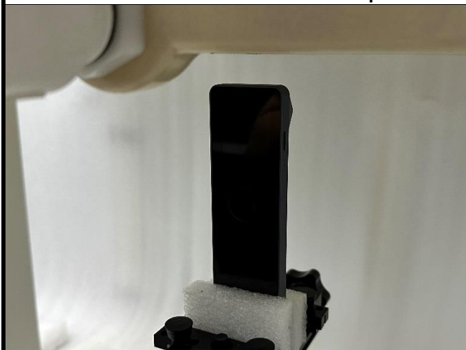
Top Side of EUT with 1.5 cm Gap