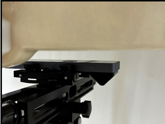
Front Face of EUT with 1.5 cm Gap