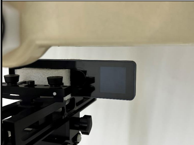
Left Side of EUT with 1.5 cm Gap