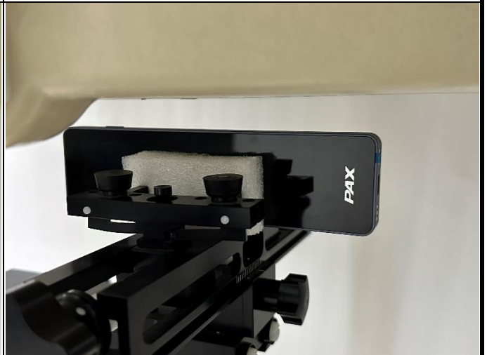
Right Side of EUT with 1.5 cm Gap