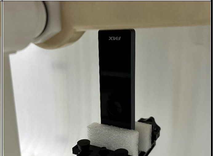
Bottom Side of EUT with 0 cm Gap