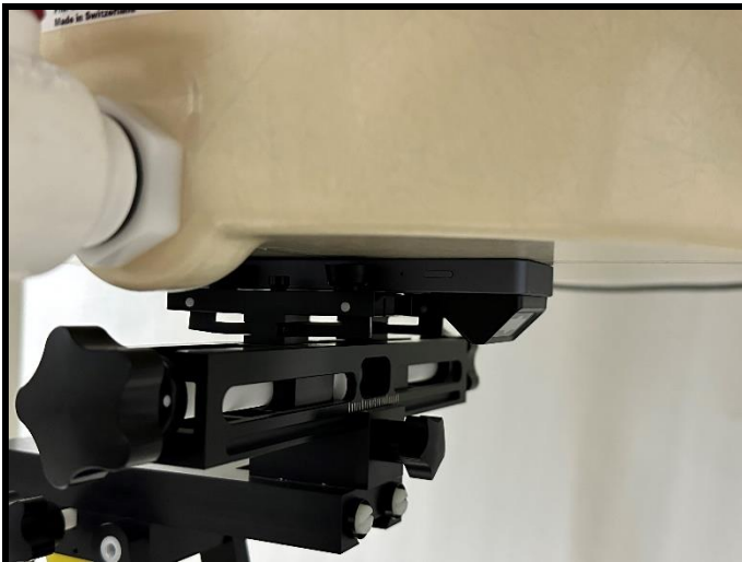
Front Face of EUT with 0 cm Gap