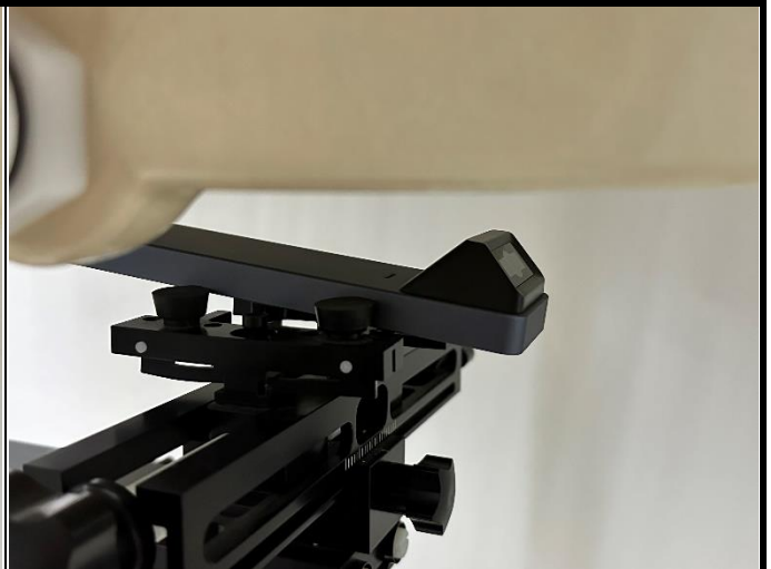
Rear Face of EUT with 1.5 cm Gap