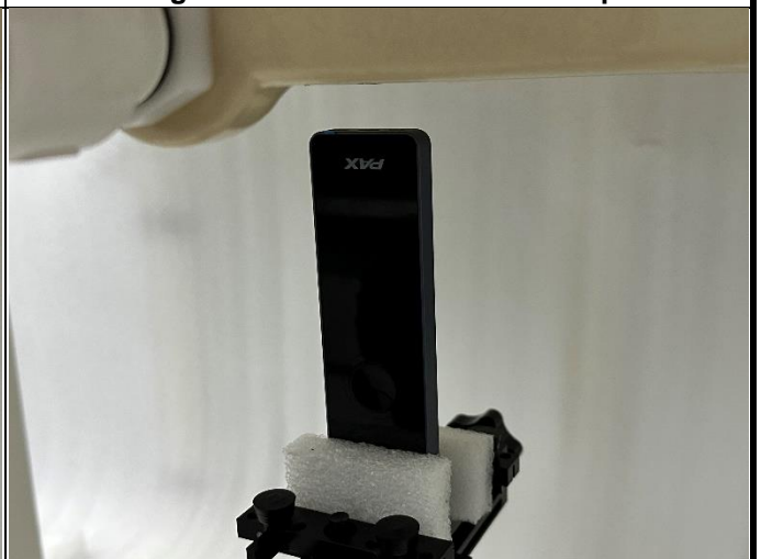
Bottom Side of EUT with 1.5 cm Gap