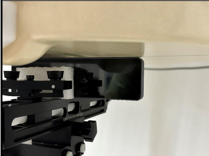
Left Side of EUT with 0 cm Gap