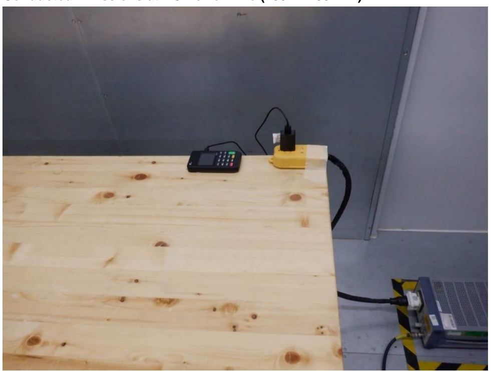
Radiated Emissions which fall in the restricted bands

Conducted Emissions at AC Power Line (150kHz-30MHz)